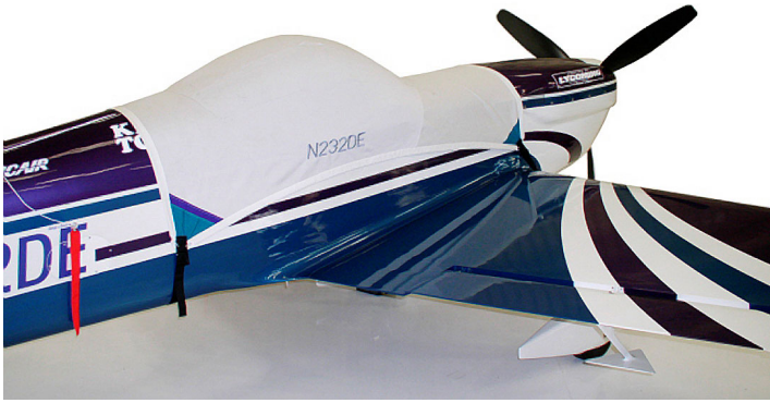
Cap 232 Canopy Cover