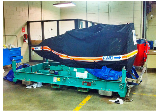
GE CF-6 QEC Engine Long-term Storage/Transport Cover "Bag" (Boeing 767)