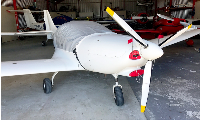
Gobosh 800XP Travel Cover, Light Weight Travel Canopy Cover and Inlet Plugs

Travel Covers are made with Silver Solution-Dyed Polyester fabric and only lined over the windshield to save weight. The material is lightweight and more compact for easy stowage in the aircraft. The polyester material is water resistant, but only intended for occasional use outside. We also have an ultra lightweight material available for fitted hangar dust covers. For daily outdoor use, the non-travel Sunbrella Cover is the best choice.