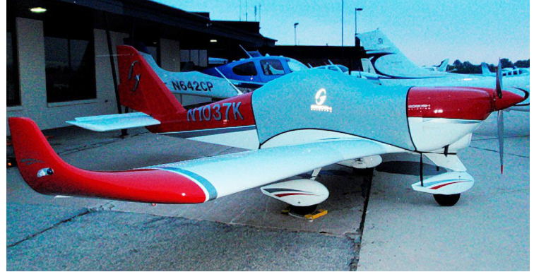
Gobosh Light Weight Travel-Cover