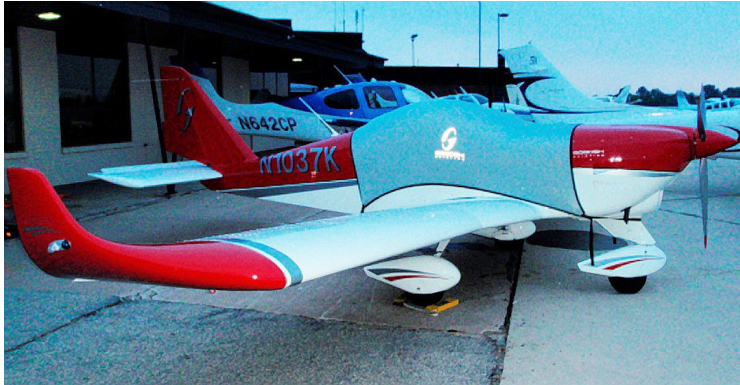
Gobosh Light Weight Travel-Cover

Travel Covers are made with Silver Solution-Dyed Polyester fabric and only lined over the windshield to save weight. The material is lightweight and more compact for easy stowage in the aircraft. The polyester material is water resistant, but only intended for occasional use outside. We also have an ultra lightweight material available for fitted hangar dust covers. For daily outdoor use, the non-travel Sunbrella Cover is the best choice.