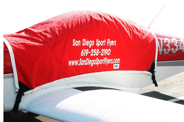
Gobosh Canopy Cover with custom Imprint