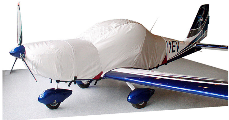
Evekotor Sportstar Extended Canopy/Engine Cover