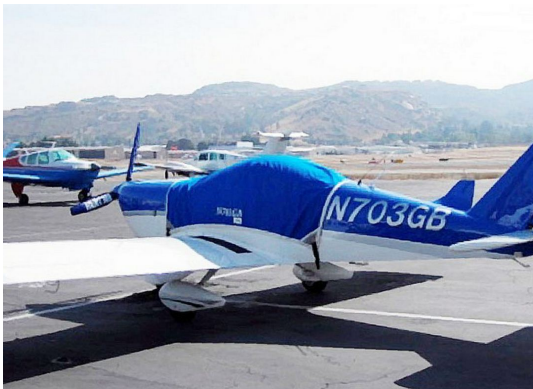
Gobosh 700S Canopy Cover (comes in colors)

This cover type is made from Silver Acrylic Sunbrella canvas and is 100% lined with a soft and smooth microfiber. Bruce's Custom Covers developed this material combination especially for aircraft protection. The outer material is medium weight and treated for water resistance, UV resistance and anti-static buildup. The inner lining is a very soft and smooth microfiber to prevent scratching. The material is very reflective, and tests show that the cabin interior temperature can be reduced to near-ambient temperature on the hottest of days. It is water, ice and snow repellent, yet breathable to allow moisture to escape from between the cover and the aircraft surface.