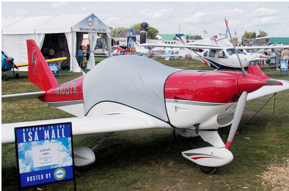
Gobosh GB7 Light Weight Travel-Cover