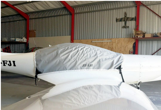
Gobosh 800XP Travel Cover, Light Weight Travel Canopy Cover

Travel Covers are made with Silver Solution-Dyed Polyester fabric and only lined over the windshield to save weight. The material is lightweight and more compact for easy stowage in the aircraft. The polyester material is water resistant, but only intended for occasional use outside. We also have an ultra lightweight material available for fitted hangar dust covers. For daily outdoor use, the non-travel Sunbrella Cover is the best choice.