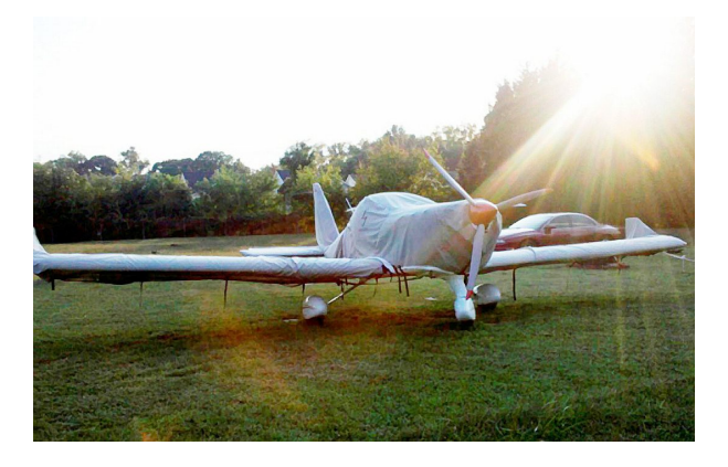
Gobosh Full Cover Set