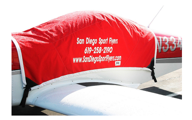
Gobosh Canopy Cover with custom Imprint

This cover type is made from Silver Acrylic Sunbrella canvas and is 100% lined with a soft and smooth microfiber. Bruce's Custom Covers developed this material combination especially for aircraft protection. The outer material is medium weight and treated for water resistance, UV resistance and anti-static buildup. The inner lining is a very soft and smooth microfiber to prevent scratching. The material is very reflective, and tests show that the cabin interior temperature can be reduced to near-ambient temperature on the hottest of days. It is water, ice and snow repellent, yet breathable to allow moisture to escape from between the cover and the aircraft surface.