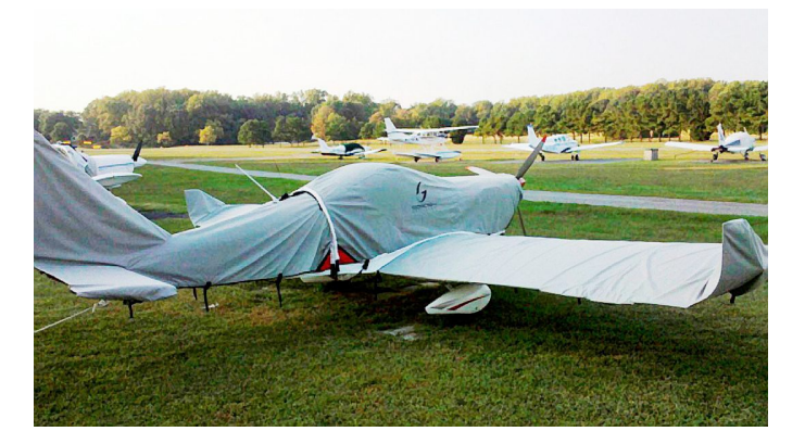
Gobosh Full Cover Set