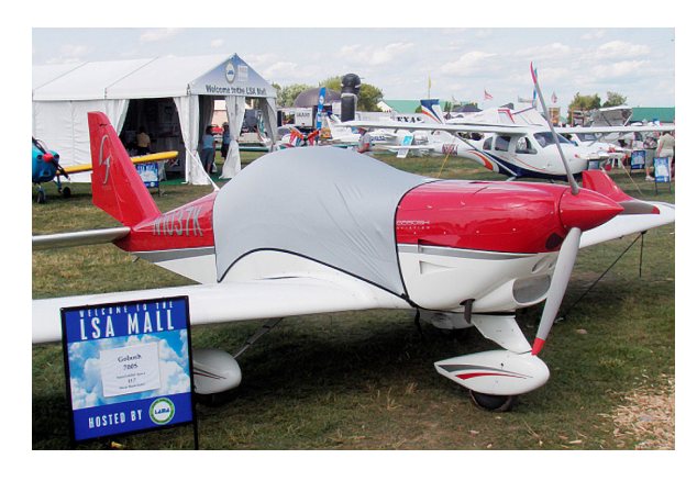
Gobosh GB7 Light Weight Travel-Cover