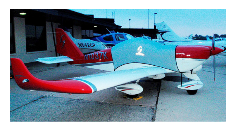
Gobosh Light Weight Travel-Cover