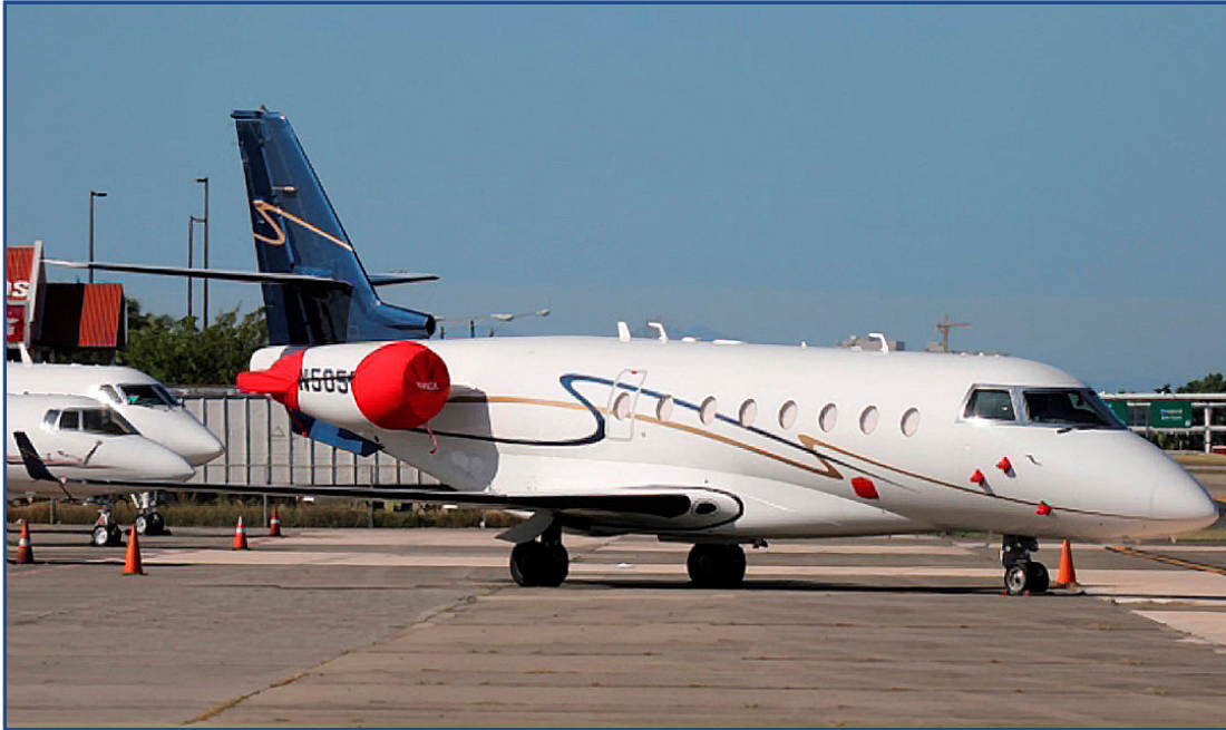
Engine Cover Set for the IAI-1126 Galaxy