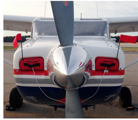
GA-8 Engine Inlet Plugs (set of 3)