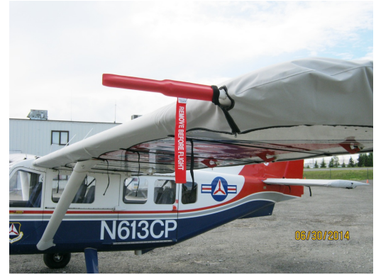
Gippsland GA-8 Airvan Wing Covers, Pitot Cover