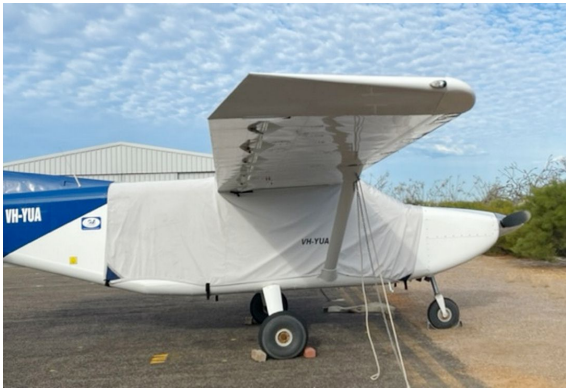
Gippsland GA-8 Extended Canopy Cover