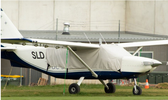
Gippsland GA-8 Canopy Cover

This cover type is made from Silver Acrylic Sunbrella canvas and is 100% lined with a soft and smooth microfiber. Bruce's Custom Covers developed this material combination especially for aircraft protection. The outer material is medium weight and treated for water resistance, UV resistance and anti-static buildup. The inner lining is a very soft and smooth microfiber to prevent scratching. The material is very reflective, and tests show that the cabin interior temperature can be reduced to near-ambient temperature on the hottest of days. It is water, ice and snow repellent, yet breathable to allow moisture to escape from between the cover and the aircraft surface.