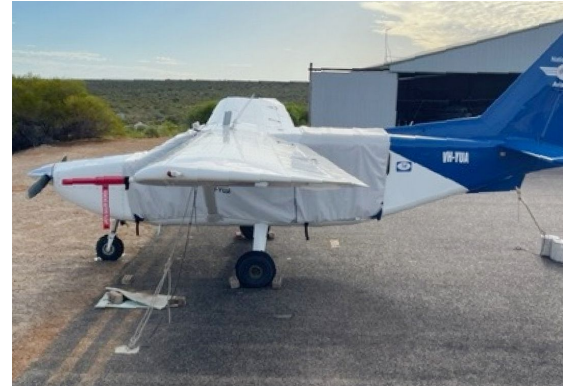
Gippsland GA-8 Extended Canopy Cover