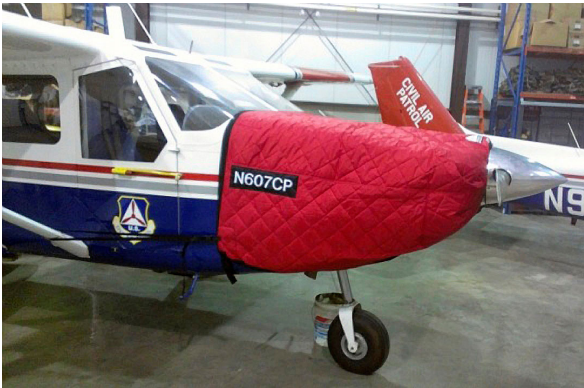
GA-8 Insulated Engine Cover

This cover type is made from Silver Acrylic Sunbrella canvas and is 100% lined with a soft and smooth microfiber. Bruce's Custom Covers developed this material combination especially for aircraft protection. The outer material is medium weight and treated for water resistance, UV resistance and anti-static buildup. The inner lining is a very soft and smooth microfiber to prevent scratching. The material is very reflective, and tests show that the cabin interior temperature can be reduced to near-ambient temperature on the hottest of days. It is water, ice and snow repellent, yet breathable to allow moisture to escape from between the cover and the aircraft surface.