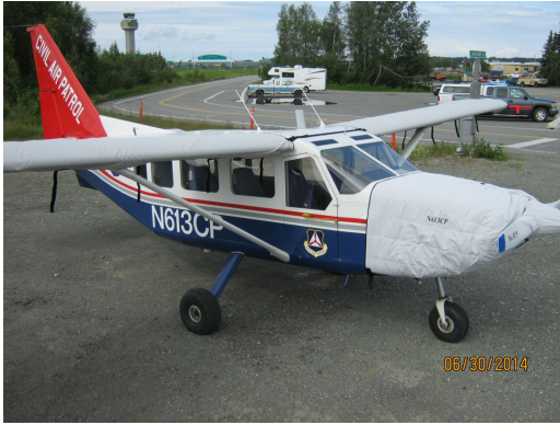
Gippsland GA-8 Airvan Insulated Engine, Wing and Prop Covers

shorter useful life if used continuously outside than the all-year use material.