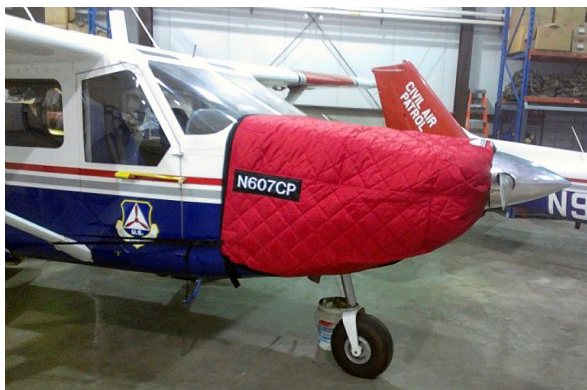
GA-8 Insulated Engine Cover

This cover type is made from Silver Acrylic Sunbrella canvas and is 100% lined with a soft and smooth microfiber. Bruce's Custom Covers developed this material combination especially for aircraft protection. The outer material is medium weight and treated for water resistance, UV resistance and anti-static buildup. The inner lining is a very soft and smooth microfiber to prevent scratching. The material is very reflective, and tests show that the cabin interior temperature can be reduced to near-ambient temperature on the hottest of days. It is water, ice and snow repellent, yet breathable to allow moisture to escape from between the cover and the aircraft surface.