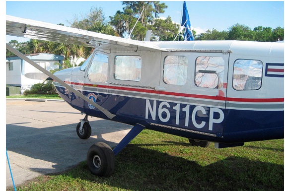
Gippsland GA-8 Airvan Cockpit & Cabin HeatShield Set