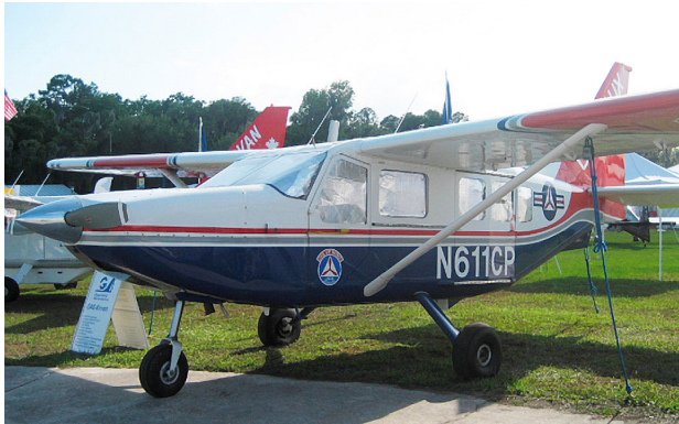
Gippsland GA-8 Airvan Cockpit & Cabin HeatShield Set

Cockpit Heatshields are interior sunshades for the aircraft's cockpit. The product is a unique composite of closed-cell foam with a silver mylar finish. The semi-rigid design is stiff enough to stand inside the window framing. The set folds up flat and is easily stored in the included storage sleeve. Some designs may require velcro and suction cups. A Heatshield is an excellent short-term remedy for cockpit overheating, but an external fabric cover is more effective for long-term protection.