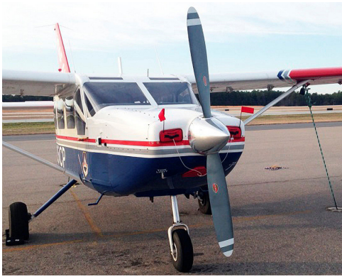
GA-8 Engine Inlet Plugs (set of 3)