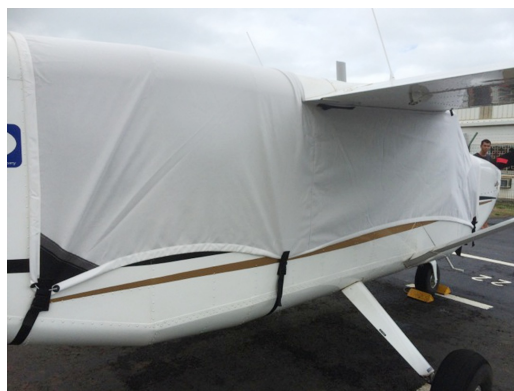
Gippsland GA-8 Airvan Canopy Cover