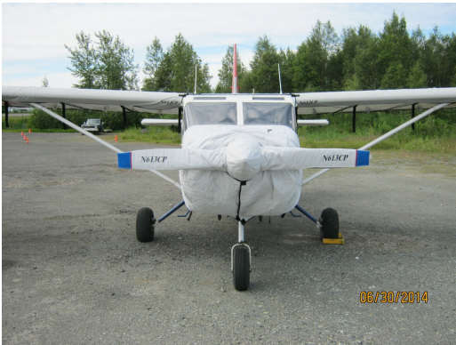
Gippsland GA-8 Airvan Insulated Engine and Prop Covers