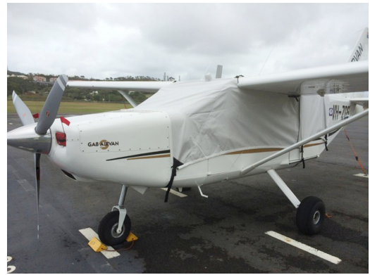
Gippsland GA-8 Airvan Canopy Cover