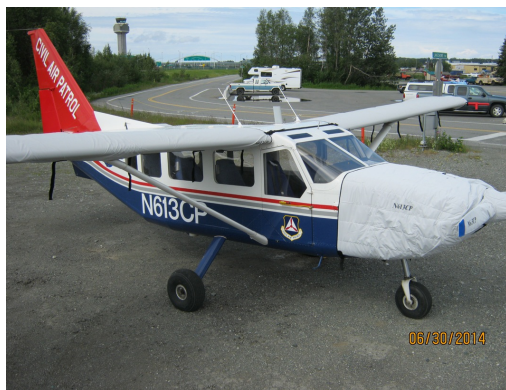
Gippsland GA-8 Airvan Insulated Engine, Wing and Prop Covers