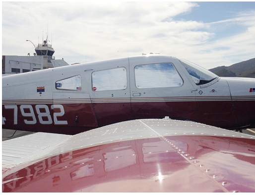
Piper PA-28 HeatShield Set