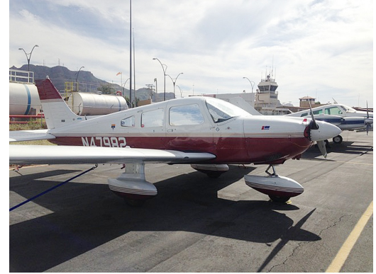
Piper PA-28 HeatShield Set