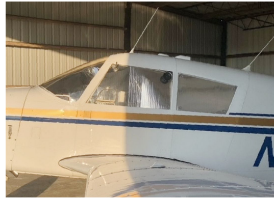
Piper PA-28-140 Cabin HeatShields