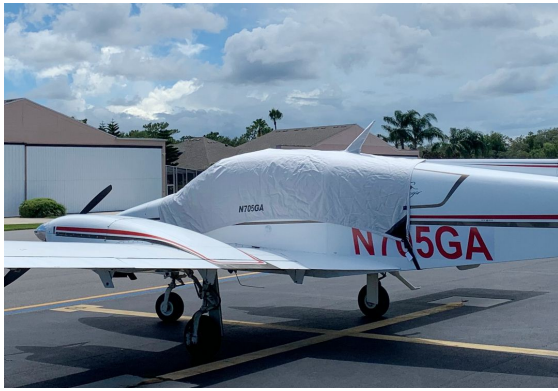
Grumman GA-7 Canopy Cover