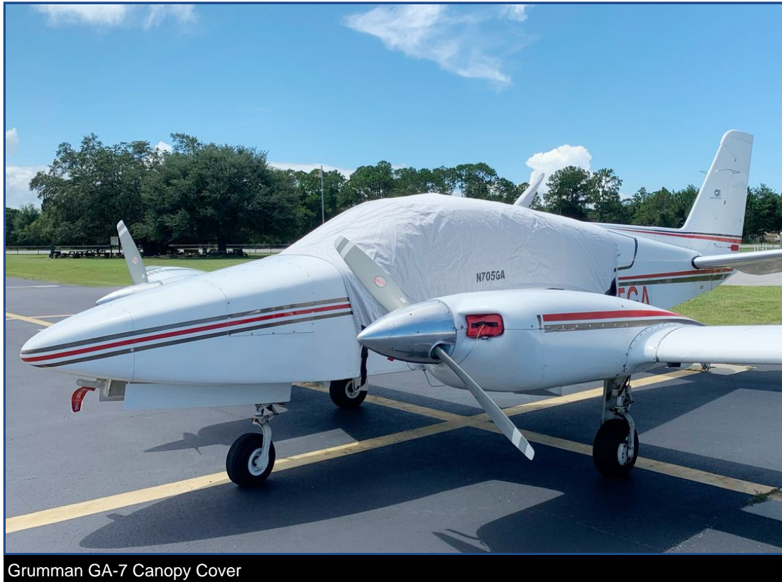
Grumman GA-7 Canopy Cover