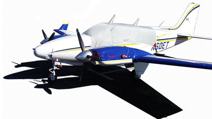
Grumman Cougar Canopy Cover, similar to Baron pictured

Travel Covers are made with Silver Solution-Dyed Polyester fabric and only lined over the windshield to save weight. The material is lightweight and more compact for easy stowage in the aircraft. The polyester material is water resistant, but only intended for occasional use outside. We also have an ultra lightweight material available for fitted hangar dust covers. For daily outdoor use, the non-travel Sunbrella Cover is the best choice.