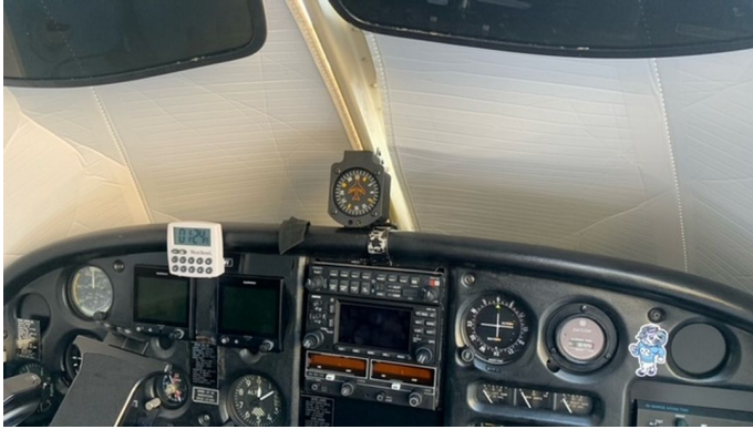
Piper PA-28-140 Cabin HeatShields

Windshield Heatshields are interior sunshades for an aircraft's front windshield. The product is a unique composite of closed-cell foam with a silver mylar finish. The semi-rigid design is stiff enough to stand along the inside of the windshield using sun visors or window framing. It folds up flat and easily stores in the included storage sleeve. Some designs may require velcro and suction cups or split right and left sides. A Heatshield is an excellent short-term remedy for cockpit overheating. An external fabric cover is far more effective and practical for long-term protection.