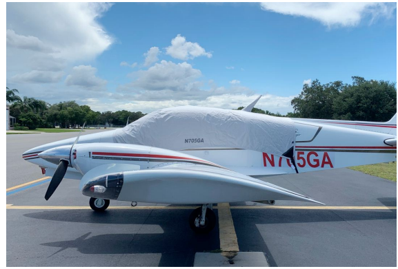
Grumman GA-7 Canopy Cover