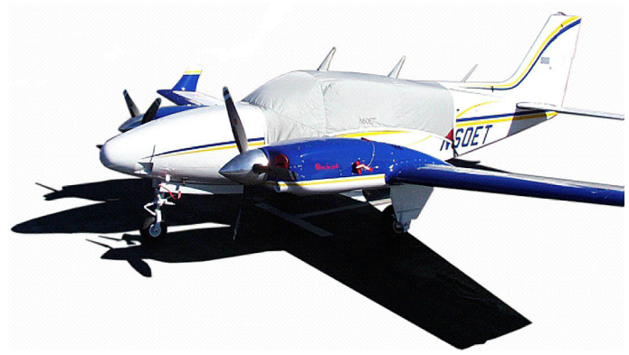
Grumman Cougar Canopy Cover, similar to Baron pictured