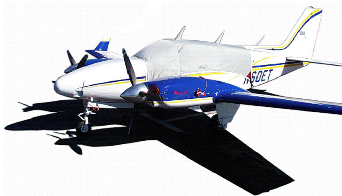
Grumman Cougar Canopy Cover, similar to Baron pictured

Travel Covers are made with Silver Solution-Dyed Polyester fabric and only lined over the windshield to save weight. The material is lightweight and more compact for easy stowage in the aircraft. The polyester material is water resistant, but only intended for occasional use outside. We also have an ultra lightweight material available for fitted hangar dust covers. For daily outdoor use, the non-travel Sunbrella Cover is the best choice.