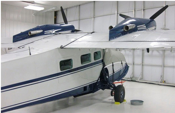
Grumman G44 Widgeon Cockpit/Nose Cover

Canopy Covers are commonly referred to as Cabin Covers, Fuselage Covers, Canvas Covers, Canopy Caps, etc.