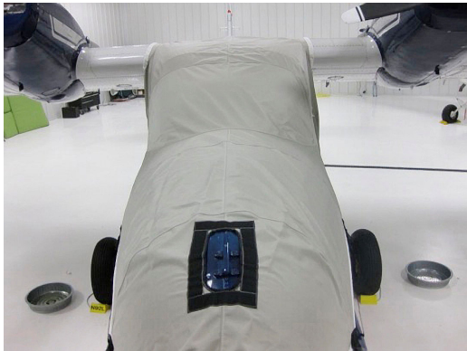
Grumman Widgeon Cockpit/Nose Cover, tie-down cleat detail