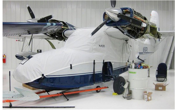
Grumman G44 Widgeon Canopy/Nose Cover