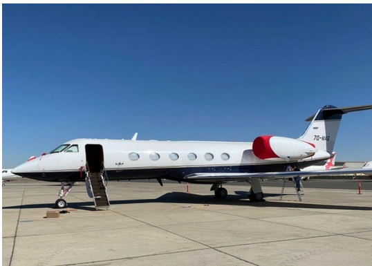
Grumman Gulfstream G-IV SP Engine Cover, bikini type

The Gulfstream Aerospace Gulfstream GVII (G400, G500, G600, G700, G800) Bikini Style Engine Covers are a single-piece design using a soft and smooth stretchy fabric. The cover stretches tightly over both the intake and exhaust, installing quickly and easily. These covers are designed to be used as hangar dust covers and have a useful life of approximately one year.