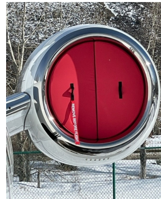
Gulfstream Aerospace Gulfstream GVII (G400,