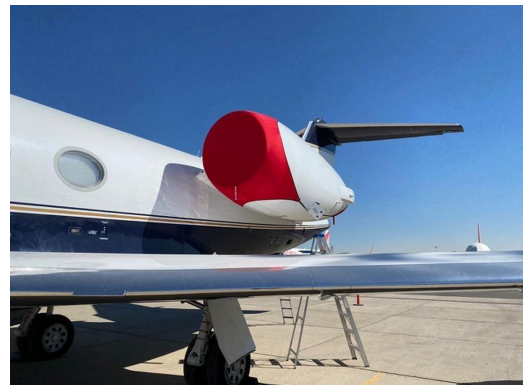
Grumman Gulfstream G-IV SP Engine Cover, bikini type