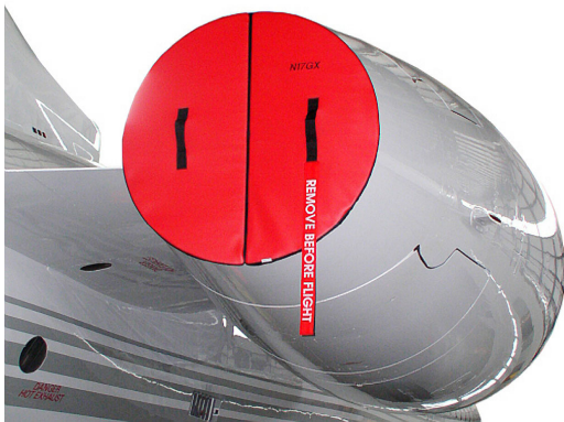
Global Express Exhaust Plugs

The Engine Inlet Plugs are custom fit for your Gulfstream Aerospace Gulfstream GVII (G400, G500, G600, G700, G800) intakes, made with heavy-duty vinyl material, and stuffed with a single block of sculpted urethane foam. Each plug has a zipper that allows the foam to be removed and dried if necessary. Engine plugs have 'remove before flight' streamers sewn onto the face of the plugs. Most plugs are imprinted with the aircraft registration number in black for an extra charge. Storage bag NOT included. Engine plugs may be inserted after flight when the engine is still warm. Engine Inlet Plugs are commonly referred to as Cowl Plugs, Intake Plugs, Cowl Blocks, Engine Blocks, and Engine Bungs.