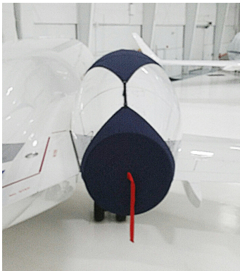
Challenger 300 Intake/Exhaust Cover Set, 3-strap type

The Gulfstream Aerospace Gulfstream IV (C-20G), G350, G450 Intake Covers are designed to install easily yet be completely storable. A spring steel hoop is sewn into the hem of each cover, allowing them to be installed without climbing onto the wing or using a stepladder. To store the covers the spring steel hoop folds like a band-saw blade into three nesting rings. Each cover folds into a compact circular bundle which is stored in the included duffle bag, yet they unfold quickly for use. The Tri-Fold Ring cover is made of medium weight nylon which is available in a variety of colors to match the paint trim. Each cover set comes complete with installation and folding instructions. The aircraft's registration number can be silkscreened onto the cover for an extra charge.