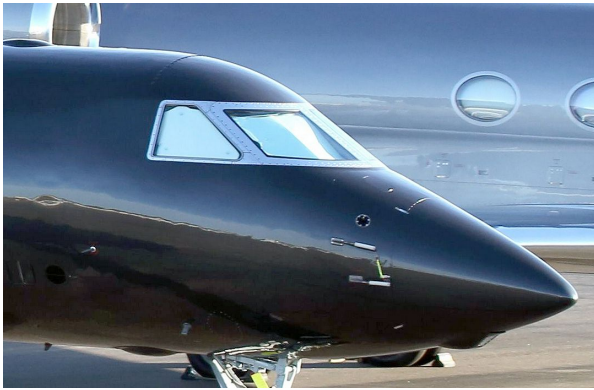
Gulfstream Cockpit Heatshields

Cockpit Heatshields are interior sunshades for the aircraft's cockpit. The product is a unique composite of closed-cell foam with a silver mylar finish. The semi-rigid design is stiff enough to stand inside the window framing. The set folds up flat and is easily stored in the included storage sleeve. Some designs may require velcro and suction cups. Our Heatshields for jets are offered white side out because some aircraft manufacturers have issued advisories against reflective window inserts due to potential heat damage. A Heatshield is an excellent short-term remedy for cockpit overheating, but an external fabric cover is more effective for long-term protection.