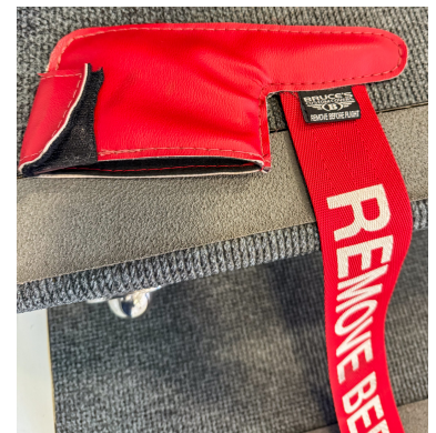
Gulfstream IV Pitot Cover