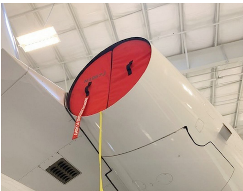
Grumman Gulfstream G-V Exhaust Plugs

The Engine Inlet Plugs are custom fit for your Gulfstream Aerospace Gulfstream IV (C-20G), G350, G450 intakes, made with heavy-duty vinyl material, and stuffed with a single block of sculpted urethane foam. Each plug has a zipper that allows the foam to be removed and dried if necessary. Engine plugs have 'remove before flight' streamers sewn onto the face of the plugs. Most plugs are imprinted with the aircraft registration number in black for an extra charge. Storage bag NOT included. Engine plugs may be inserted after flight when the engine is still warm. Engine Inlet Plugs are commonly referred to as Cowl Plugs, Intake Plugs, Cowl Blocks, Engine Blocks, and Engine Bunges.