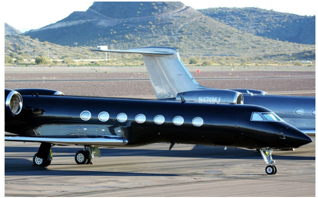
Gulfstream Cockpit Heatshields