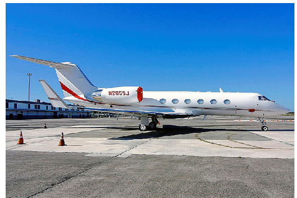
Gulfstream G-IV Intake Covers