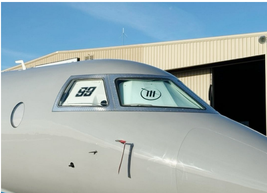
Gulfstream G200 Cockpit Heatshields

Cockpit Heatshields are interior sunshades for the aircraft's cockpit. The product is a unique composite of closed-cell foam with a silver mylar finish. The semi-rigid design is stiff enough to stand inside the window framing. The set folds up flat and is easily stored in the included storage sleeve. Some designs may require velcro and suction cups. Our Heatshields for jets are offered white side out because some aircraft manufacturers have issued advisories against reflective window inserts due to potential heat damage. A Heatshield is an excellent short-term remedy for cockpit overheating, but an external fabric cover is more effective for long-term protection.