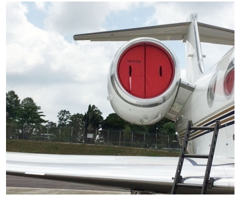
Grumman Gulfstream G450 Intake Plugs