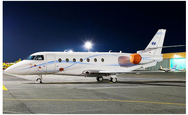
Gulfstream 200 Intake Covers