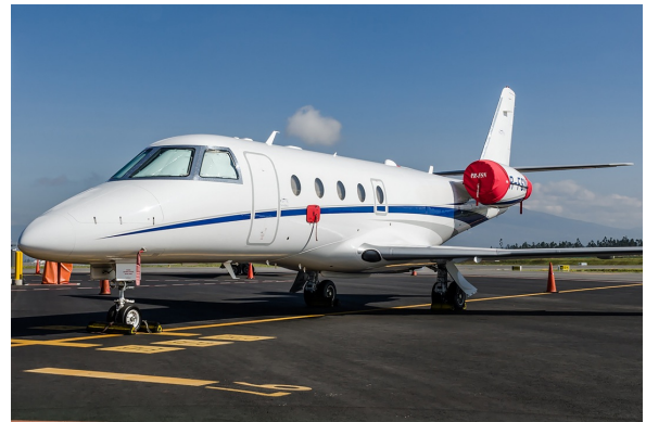
Gulfstream G150 Engine Covers, Cockpit HeatShields