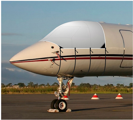
G-V Cockpit/Windshield Cover (Illustration)

the hottest of days. It is water, ice and snow repellent, yet breathable to allow moisture to escape from between the cover and the aircraft surface.