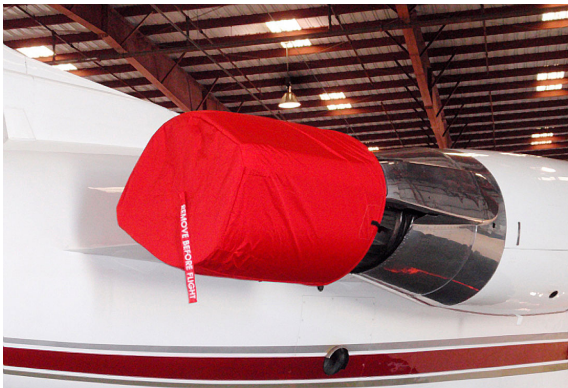
Stage III Quiet Technologies Hush Kit Cover

The Gulfstream Aerospace Gulfstream II, III (C-20D) Intake Covers are designed to install easily yet be completely storable. A spring steel hoop is sewn into the hem of each cover, allowing them to be installed without climbing onto the wing or using a stepladder. To store the covers the spring steel hoop folds like a band-saw blade into three nesting rings. Each cover folds into a compact circular bundle which is stored in the included duffle bag, yet they unfold quickly for use. The Tri-Fold Ring cover is made of medium weight nylon which is available in a variety of colors to match the paint trim. Each cover set comes complete with installation and folding instructions. The aircraft's registration number can be silkscreened onto the cover for an extra charge.