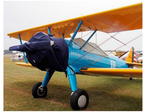
Stearman PT-13 Engine Cover