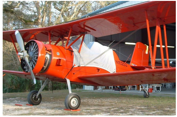
Grumman Ag Cat G-164, Open Cockpit, Canopy Cover