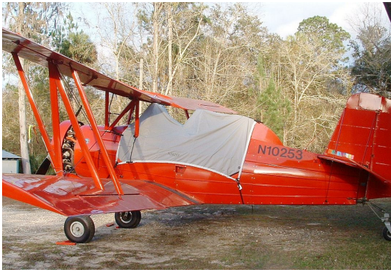
Grumman Ag Cat G-164, Open Cockpit, Canopy Cover