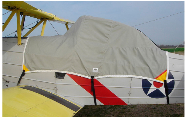
Grumman Ag-Cat Canopy Cover