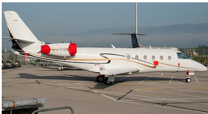
Engine Cover Set