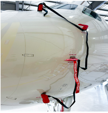
Gulfstream GVII Pitot Probes/TAT/Ice Detector Set, Heat Resistant Type