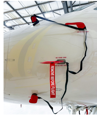
Gulfstream GVII Pitot Probes/TAT/Ice Detector Set, Heat Resistant Type