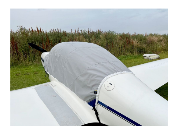
Grob 109 Travel Cover, Light Weight Canopy Cover