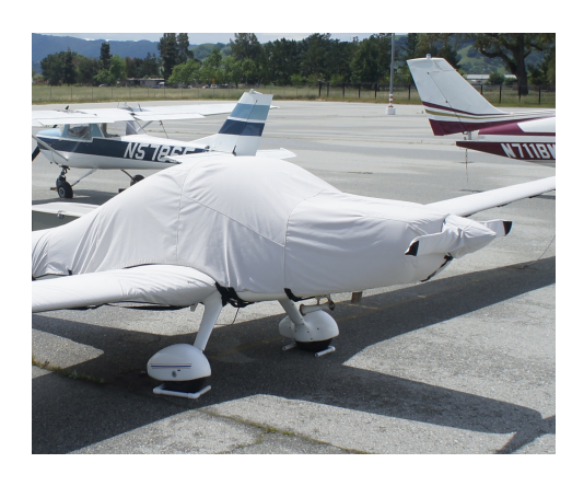
Grob 109 Prop Cover