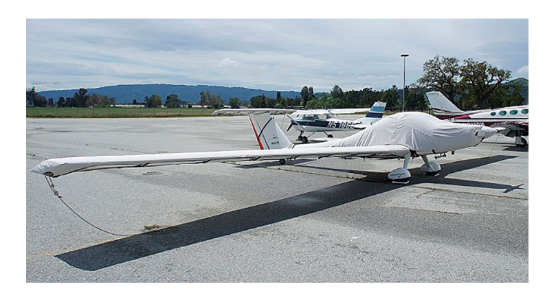
Grob 109 Canopy/Engine w/ extension to tail, Wing, Stabilizer & Grob 109 Canopy/Engine w/ extension to tail, Wing, Stabilizer Prop/Spinner Covers

WINTER USE MATERIAL - Made with Solution-Dyed Polyester fabric, this option is intended for seasonal use to aid in deicing, rain mitigation, or for occasional travel. The material is lighter and more compact, but more susceptible to UV damage and may have a shorter useful life if used continuously outside than the all-year use material.