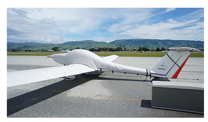
& Prop/Spinner Covers