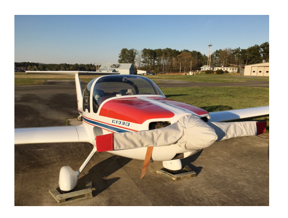
Grob 109 Prop Cover