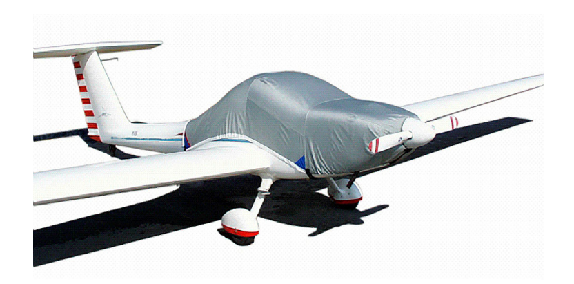
Grob 109 Canopy/Engine Cover