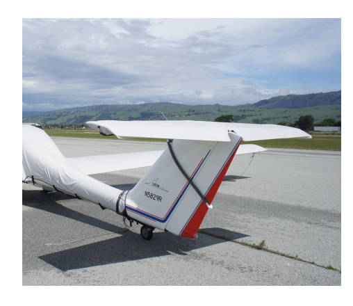
Grob 109 Horizontal Stabilizer Cover