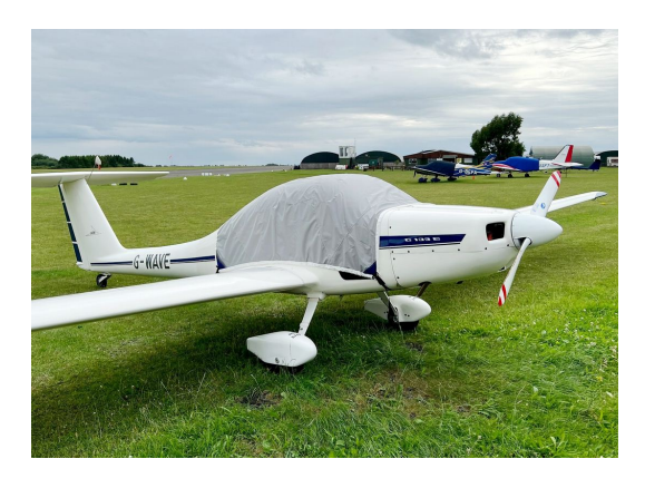
Grob 109 Travel Cover, Light Weight Canopy Cover