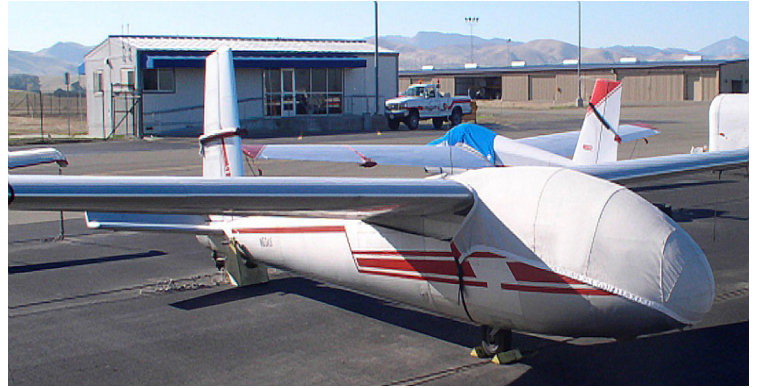
Blanik L13 Canopy/Nose Cover