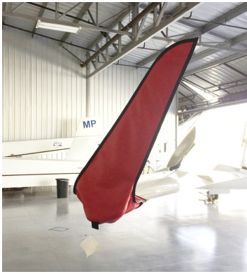
Schleicher ASH Wingtip Pads