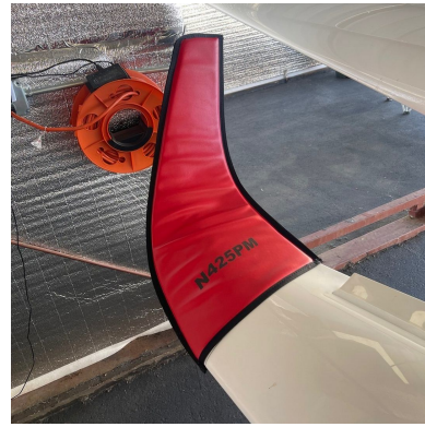
Stemme S-10 & S-12 Wingtip Pads