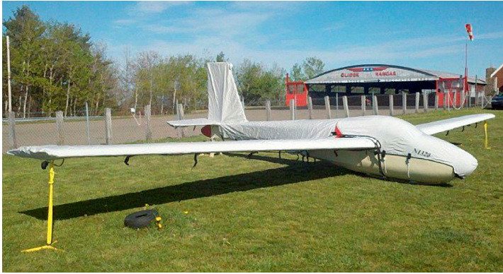
Schweizer 1-26B Canopy/Nose, Empennage & Wing Covers

This cover type is made from Silver Acrylic Sunbrella canvas and is 100% lined with a soft and smooth microfiber. Bruce's Custom Covers developed this material combination especially for aircraft protection. The outer material is medium weight and treated for water resistance, UV resistance and anti-static buildup. The inner lining is a very soft and smooth microfiber to prevent scratching. The material is very reflective, and tests show that the cabin interior temperature can be reduced to near-ambient temperature on the hottest of days. It is water, ice and snow repellent, yet breathable to allow moisture to escape from between the cover and the aircraft surface.