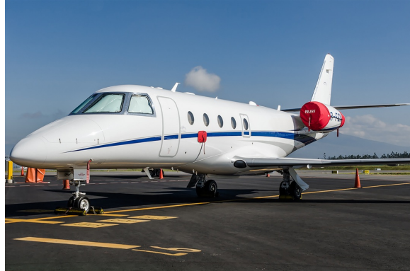
Gulfstream G150 Engine Covers, Cockpit HeatShields

Heatshield Interior Reflectors are made of a special laminate of metallized polyester film and closed cell foam. Less than 1/8" thick, the Reflector can fold up flat and store in a sleeve, yet is stiff enough when flat to stand up against the windshield using the sun visors and window framing only. On some designs no Velcro or suction cups are necessary. Heatshields are an excellent short-term remedy for cockpit overheating, but use the Cockpit Cover for more effective and practical long term protection.