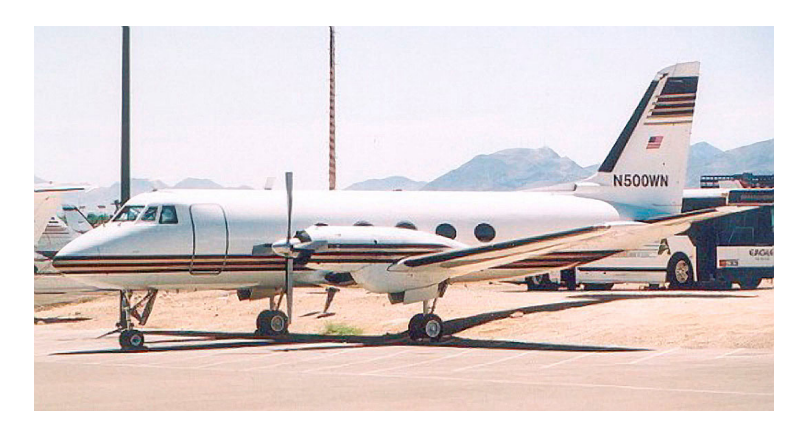
Covers, Plugs, HeatShields and related items for the Grumman Gulfstream I