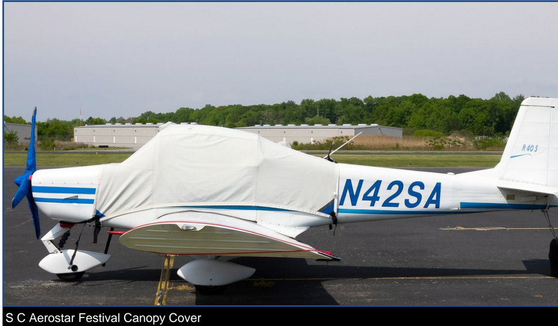
S C Aerostar Festival Canopy Cover