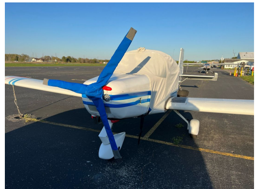
S C Aerostar Festival Prop Cover, Extended Canopy Cover