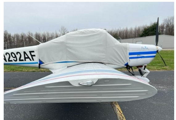
SC Aerostar Festival Canopy Cover