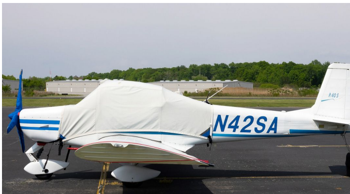
S C Aerostar Festival Canopy Cover

This cover type is made from Silver Acrylic Sunbrella canvas and is 100% lined with a soft and smooth microfiber. Bruce's Custom Covers developed this material combination especially for aircraft protection. The outer material is medium weight and treated for water resistance, UV resistance and anti-static buildup. The inner lining is a very soft and smooth microfiber to prevent scratching. The material is very reflective, and tests show that the cabin interior temperature can be reduced to near-ambient temperature on the hottest of days. It is water, ice and snow repellent, yet breathable to allow moisture to escape from between the cover and the aircraft surface.