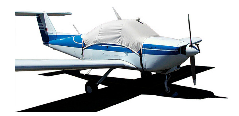
FLS Club Sprint Extended Canopy Cover