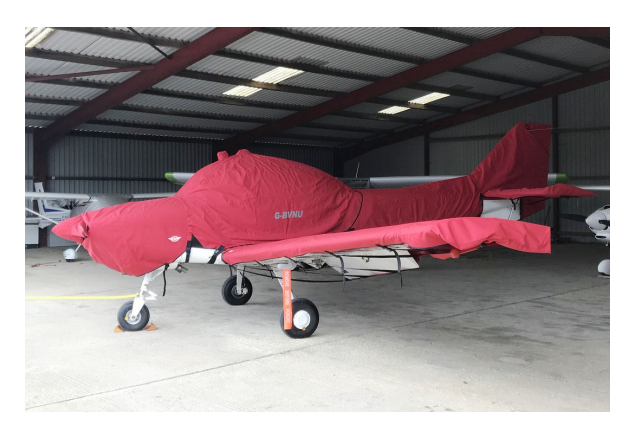
FLS Club Sprint Empennage Cover (Tailboom, Vertical & Horiz Stabilizers) All Year Use