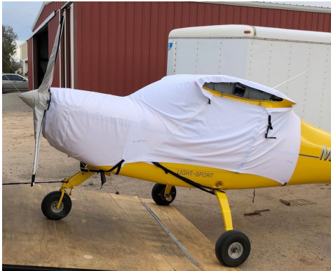
FK-Lightplanes FK-9 Canopy & Engine Covers, test fit covers

This cover type is made from Silver Acrylic Sunbrella canvas and is 100% lined with a soft and smooth microfiber. Bruce's Custom Covers developed this material combination especially for aircraft protection. The outer material is medium weight and treated for water resistance, UV resistance and anti-static buildup. The inner lining is a very soft and smooth microfiber to prevent scratching. The material is very reflective, and tests show that the cabin interior temperature can be reduced to near-ambient temperature on the hottest of days. It is water, ice and snow repellent, yet breathable to allow moisture to escape from between the cover and the aircraft surface.