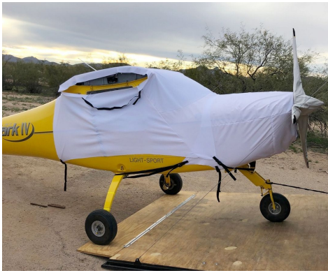
FK-Lightplanes FK-9 Canopy & Engine Covers, test fit covers