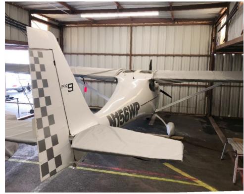
FK 9 MARK IV Wing & Horizontal Stabilizer Dust Covers