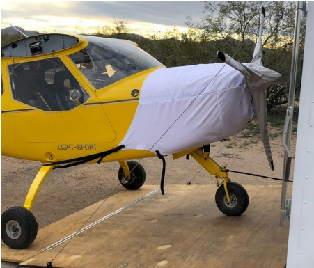
FK-9 Engine Cover, test fit cover