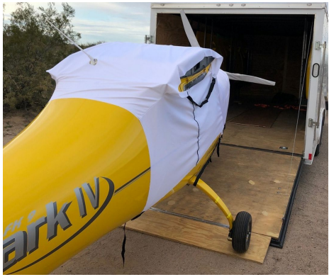
FK-Lightplanes FK-9 Canopy Cover, test fit cover