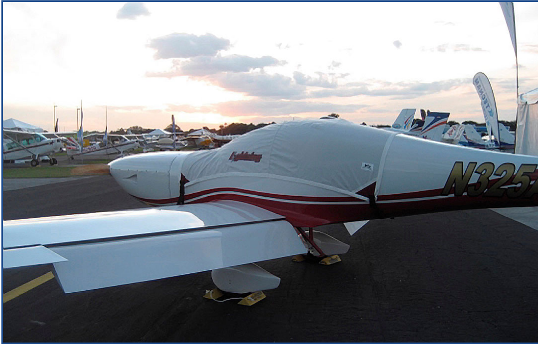
Arion Lightning Canopy Cover