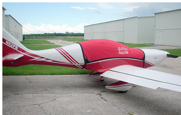
Lightning Canopy Cover, available in colors