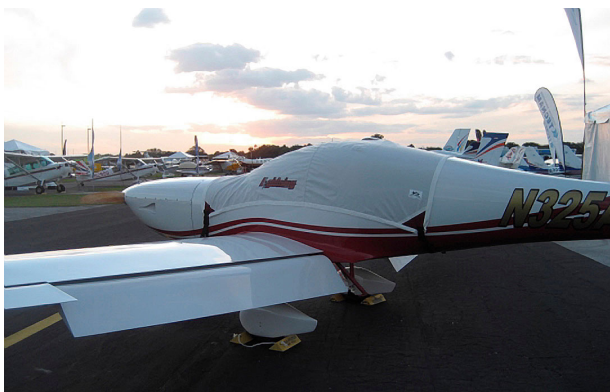
Arion Lightning Canopy Cover