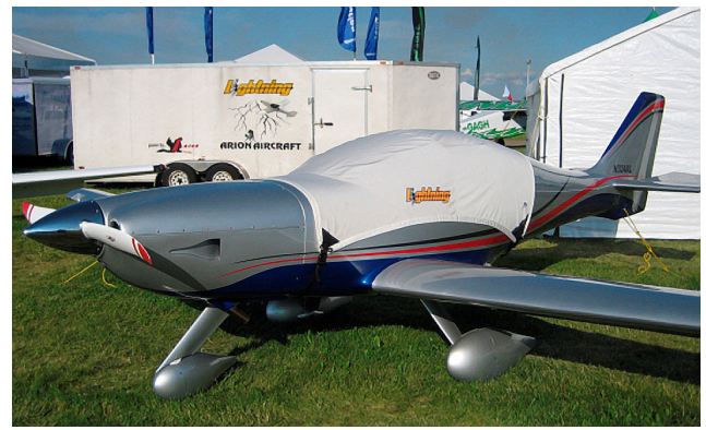
Lightning Canopy Cover