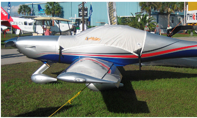
Lightning Canopy Cover