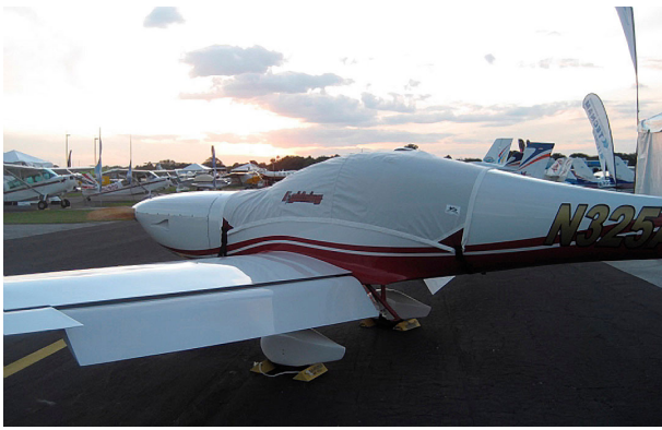
Arion Lightning Canopy Cover