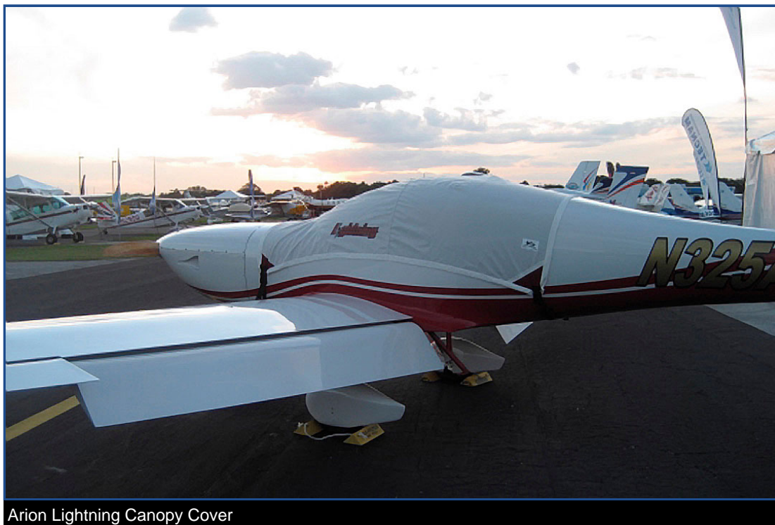
Arion Lightning Canopy Cover