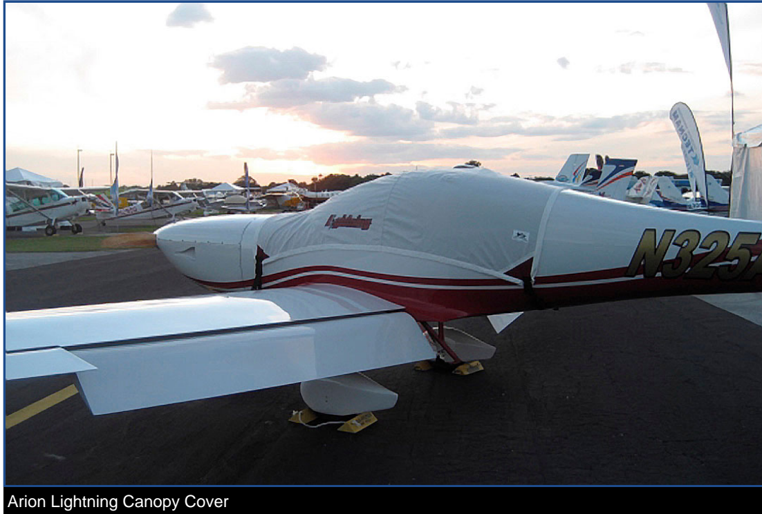
Arion Lightning Canopy Cover