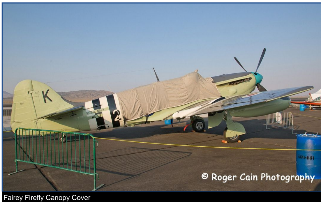
Fairey Firefly Canopy Cover