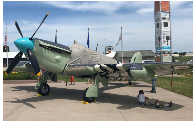
Fairey Firefly Canopy Cover