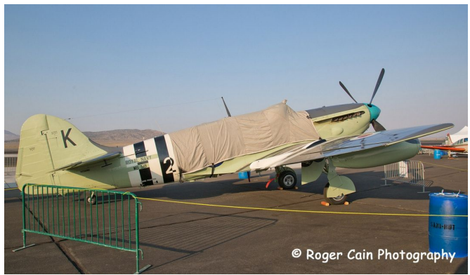
Fairey Firefly Canopy Cover