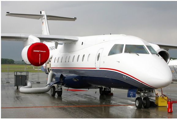
Fairchild/Dornier 328 Engine Covers