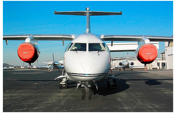
Fairchild /Dornier 328 Engine Covers