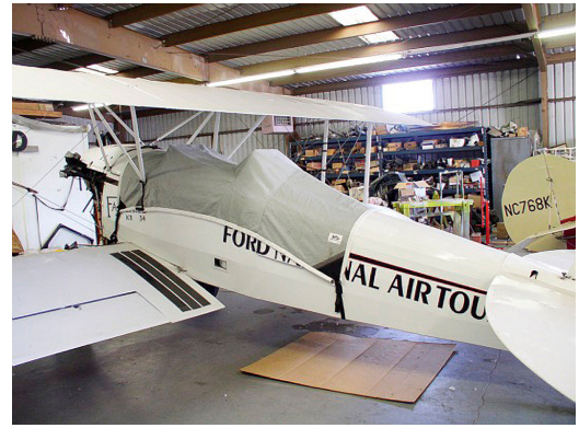
Fairchild KR-34 Canopy Cover