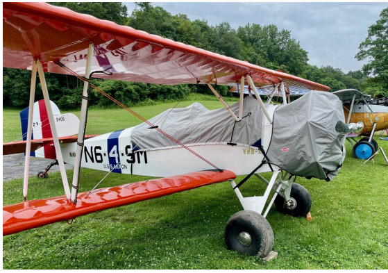
Fleet Biplane Model 1 Canopy & Engine Covers