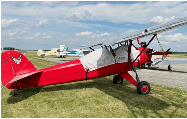
Davis D-1K Canopy Cover