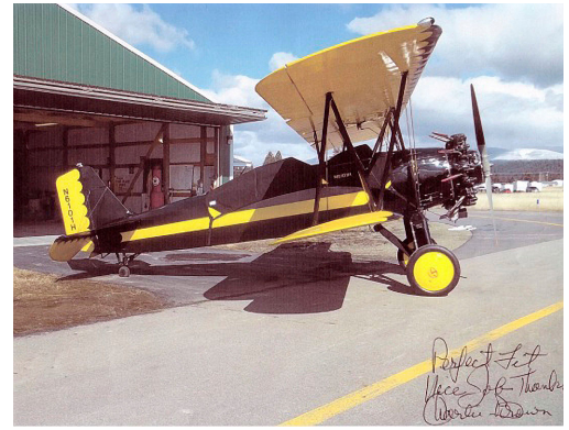
Stearman C3 Canopy Cover