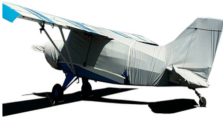
Maule Empennage, Engine & Prop Covers

WINTER USE MATERIAL - Made with Solution-Dyed Polyester fabric, this option is intended for seasonal use to aid in deicing, rain mitigation, or for occasional travel. The material is lighter and more compact, but more susceptible to UV damage and may have a shorter useful life if used continuously outside than the all-year use material.