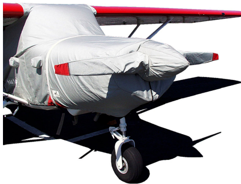
Maule Prop (2 Blade), Engine, & Canopy Cover

This cover type is made from Silver Acrylic Sunbrella canvas and is 100% lined with a soft and smooth microfiber. Bruce's Custom Covers developed this material combination especially for aircraft protection. The outer material is medium weight and treated for water resistance, UV resistance and anti-static buildup. The inner lining is a very soft and smooth microfiber to prevent scratching. The material is very reflective, and tests show that the cabin interior temperature can be reduced to near-ambient temperature on the hottest of days. It is water, ice and snow repellent, yet breathable to allow moisture to escape from between the cover and the aircraft surface.