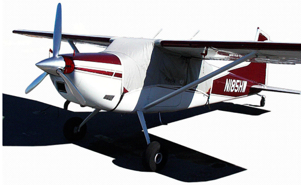
Cessna 185 Over-the-Top Canopy Cover

This cover type is made from Silver Acrylic Sunbrella canvas and is 100% lined with a soft and smooth microfiber. Bruce's Custom Covers developed this material combination especially for aircraft protection. The outer material is medium weight and treated for water resistance, UV resistance and anti-static buildup. The inner lining is a very soft and smooth microfiber to prevent scratching. The material is very reflective, and tests show that the cabin interior temperature can be reduced to near-ambient temperature on the hottest of days. It is water, ice and snow repellent, yet breathable to allow moisture to escape from between the cover and the aircraft surface.