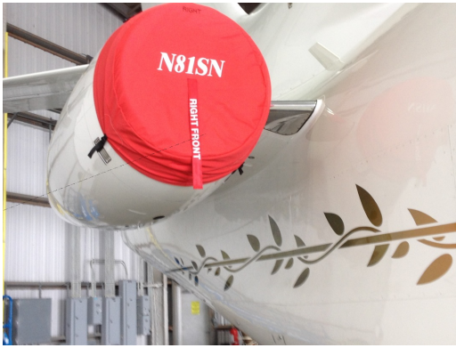
Falcon 900EX Intake Cover