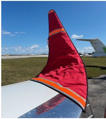
Falcon Jet 900 Winglet Padding Covers