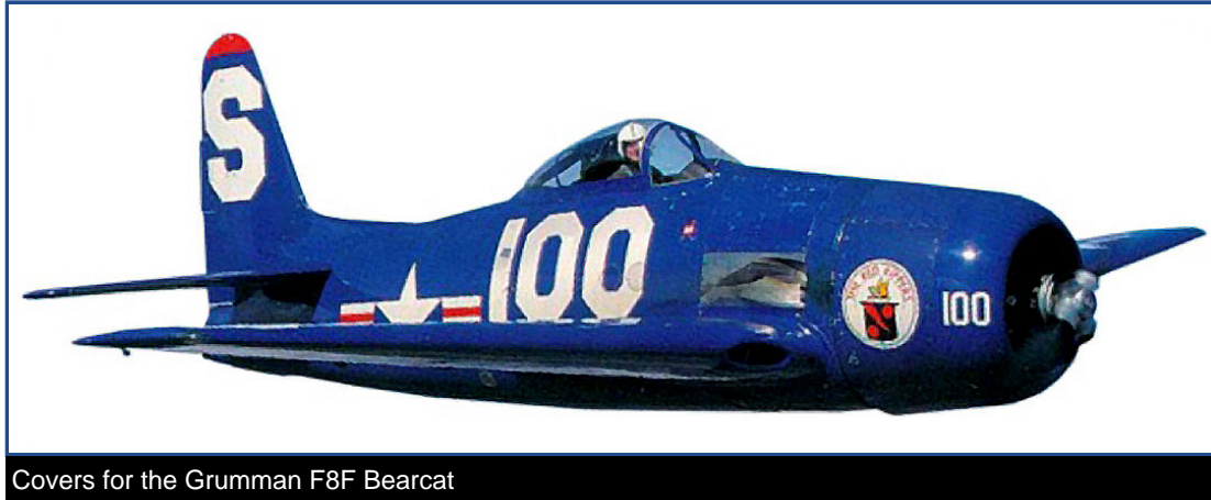
Covers for the Grumman F8F Bearcat