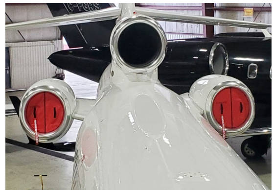
Falcon F7X Outboard Intake Plugs