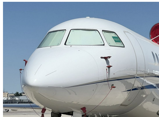
Falcon Jet 7X Cockpit Heatshields