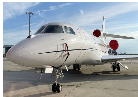
Falcon 7X Engine Cover Set, Pitot Covers