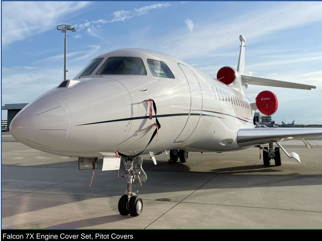
Falcon 7X Engine Cover Set, Pitot Covers