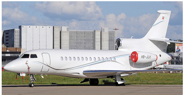
Falcon 7X Engine Covers (Outboard Engines & Center Exhaust)