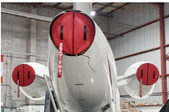
Falcon F7X Exhaust Plugs

The Engine Inlet Plugs are custom fit for your Falcon Jet 7X intakes, made with heavy-duty vinyl material, and stuffed with a single block of sculpted urethane foam. Each plug has a zipper that allows the foam to be removed and dried if necessary. Engine plugs have 'remove before flight' streamers sewn onto the face of the plugs. Most plugs are imprinted with the aircraft registration number in black for an extra charge. Storage bag NOT included. Engine plugs may be inserted after flight when the engine is still warm. Engine Inlet Plugs are commonly referred to as Cowl Plugs, Intake Plugs, Cowl Blocks, Engine Blocks, and Engine Bungs.