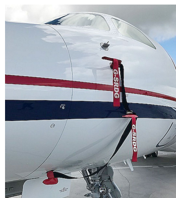
Falcon Jet 7X Pitot Probe/Aoa Set, Heat Resistant Type