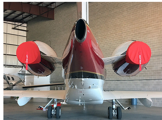
Canadair Challenger 300 Intake/Exhaust Covers, 3-Strap Type Canadair Challenger 300 Intake/Exhaust Covers, 3-Strap Type