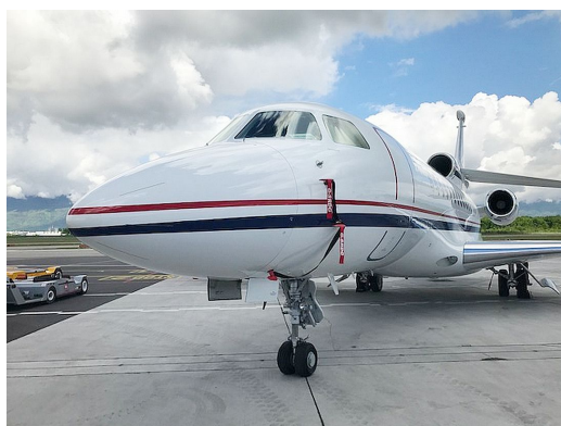
Falcon Jet 7X Pitot Probe/Aoa Set, Heat Resistant Type

The Engine Inlet Plugs are custom fit for your Falcon Jet 6X intakes, made with heavy-duty vinyl material, and stuffed with a single block of sculpted urethane foam. Each plug has a zipper that allows the foam to be removed and dried if necessary. Engine plugs have 'remove before flight' streamers sewn onto the face of the plugs. Most plugs are imprinted with the aircraft registration number in black for an extra charge. Storage bag NOT included. Engine plugs may be inserted after flight when the engine is still warm. Engine Inlet Plugs are commonly referred to as Cowl Plugs, Intake Plugs, Cowl Blocks, Engine Blocks, and Engine Bungs.