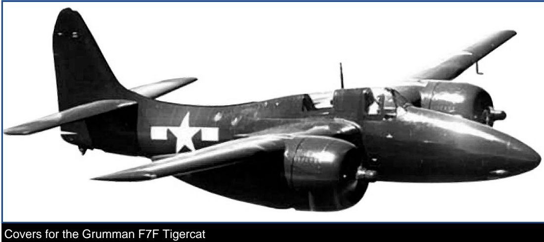
Covers for the Grumman F7F Tigercat