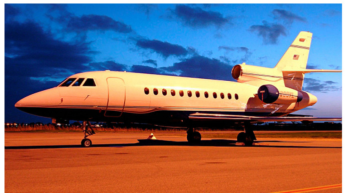
Falcon 900 Engine Covers