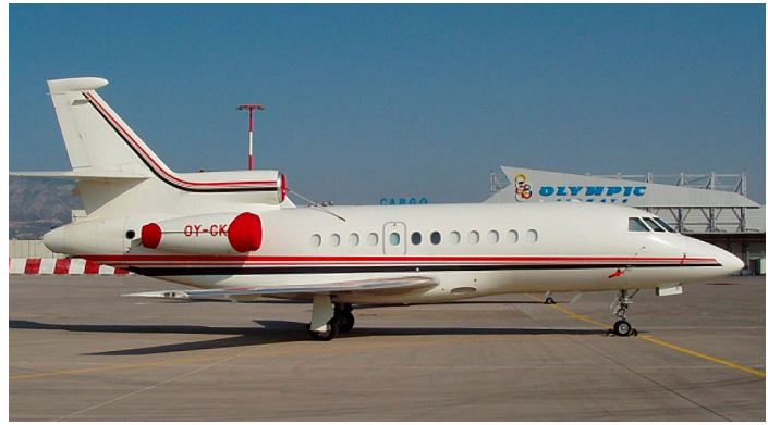
Falcon 900 Engine Covers