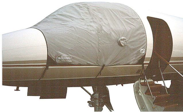
Falcon 50 Windshield Cover

This cover type is made from Silver Acrylic Sunbrella canvas and is 100% lined with a soft and smooth microfiber. Bruce's Custom Covers developed this material combination especially for aircraft protection. The outer material is medium weight and treated for water resistance, UV resistance and anti-static buildup. The inner lining is a very soft and smooth microfiber to prevent scratching. The material is very reflective, and tests show that the cabin interior temperature can be reduced to near-ambient temperature on the hottest of days. It is water, ice and snow repellent, yet breathable to allow moisture to escape from between the cover and the aircraft surface.