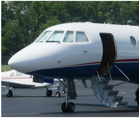
Dassault Falcon 50 Cockpit HeatShields