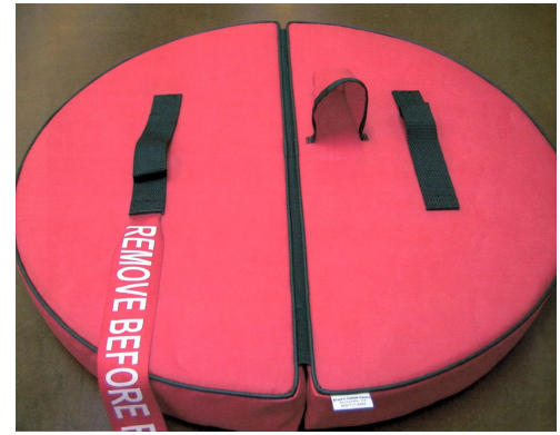
Falcon Center Engine Intake Plug