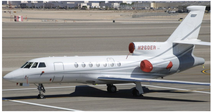
Falcon 50 Engine Covers, outboard engines only