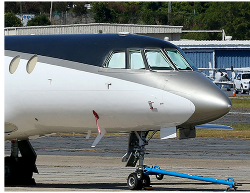
Dassault Falcon 50 Cockpit HeatShields