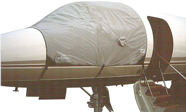
Falcon 50 Windshield Cover

This cover type is made from Silver Acrylic Sunbrella canvas and is 100% lined with a soft and smooth microfiber. Bruce's Custom Covers developed this material combination especially for aircraft protection. The outer material is medium weight and treated for water resistance, UV resistance and anti-static buildup. The inner lining is a very soft and smooth microfiber to prevent scratching. The material is very reflective, and tests show that the cabin interior temperature can be reduced to near-ambient temperature on the hottest of days. It is water, ice and snow repellent, yet breathable to allow moisture to escape from between the cover and the aircraft surface.