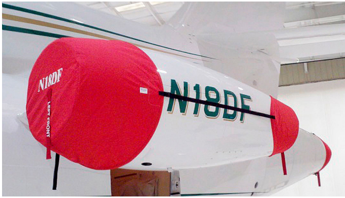
Falcon 900 Engine Cover Set