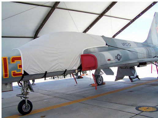
Northrup F5 Talon Canopy Cover

This cover type is made from Silver Acrylic Sunbrella canvas and is 100% lined with a soft and smooth microfiber. Bruce's Custom Covers developed this material combination especially for aircraft protection. The outer material is medium weight and treated for water resistance, UV resistance and anti-static buildup. The inner lining is a very soft and smooth microfiber to prevent scratching. The material is very reflective, and tests show that the cabin interior temperature can be reduced to near-ambient temperature on the hottest of days. It is water, ice and snow repellent, yet breathable to allow moisture to escape from between the cover and the aircraft surface.