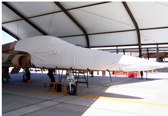
Northrup F-5 Talon Canopy/Nose Cover