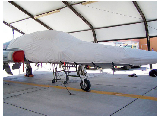
Northup F5 Talon Canopy Cover