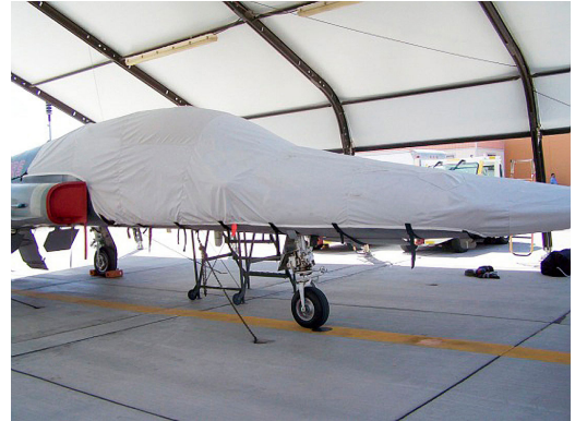
Northrup F5 Talon Canopy Cover