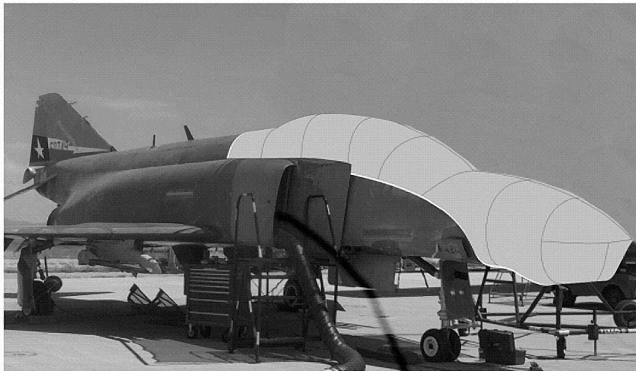
F4 Phantom Canopy/Nose Cover