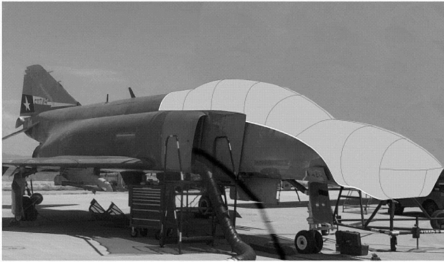
F4 Phantom Canopy/Nose Cover

Canopy Covers are commonly referred to as Cabin Covers, Fuselage Covers, Canvas Covers, Canopy Caps, etc.