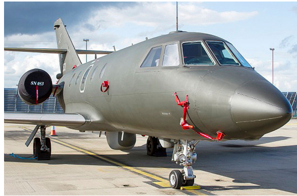
Falcon Engine Covers (not our probe covers)

The Engine Inlet Plugs are custom fit for your Falcon Jet 200 (20H) intakes, made with heavy-duty vinyl material, and stuffed with a single block of sculpted urethane foam. Each plug has a zipper that allows the foam to be removed and dried if necessary. Engine plugs have 'remove before flight' streamers sewn onto the face of the plugs. Most plugs are imprinted with the aircraft registration number in black for an extra charge. Storage bag NOT included. Engine plugs may be inserted after flight when the engine is still warm. Engine Inlet Plugs are commonly referred to as Cowl Plugs, Intake Plugs, Cowl Blocks, Engine Blocks, and Engine Bungs.