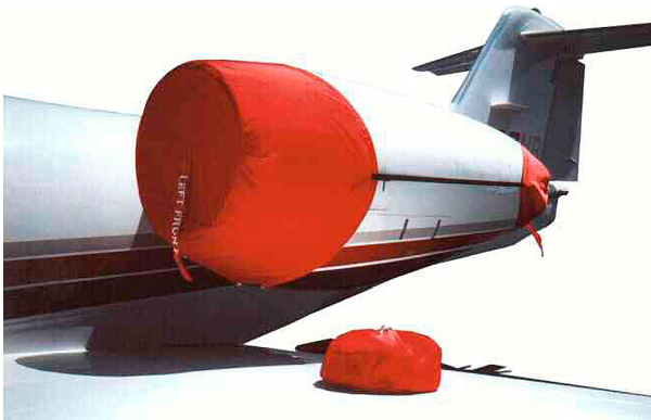
Lear 30 Tri-Fold Engine Cover

The Falcon Jet 200 (20H) Intake Covers are designed to install easily yet be completely storable. A spring steel hoop is sewn into the hem of each cover, allowing them to be installed without climbing onto the wing or using a stepladder. To store the covers the spring steel hoop folds like a band-saw blade into three nesting rings. Each cover folds into a compact circular bundle which is stored in the included duffle bag, yet they unfold quickly for use. The Tri-Fold Ring cover is made of medium weight nylon which is available in a variety of colors to match the paint trim. Each cover set comes complete with installation and folding instructions. The aircraft's registration number can be silkscreened onto the cover for an extra charge.