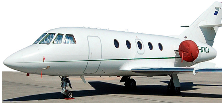
Falcon Engine Cover & Cockpit HeatShields