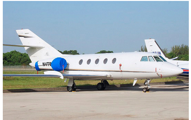
Falcon Engine Cover & Cockpit HeatShields