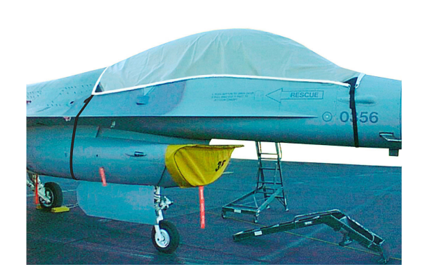
Canopy Cover, F-16

Travel Covers are made with Silver Solution-Dyed Polyester fabric and only lined over the windshield to save weight. The material is lightweight and more compact for easy stowage in the aircraft. The polyester material is water resistant, but only intended for occasional use outside. We also have an ultra lightweight material available for fitted hangar dust covers. For daily outdoor use, the non-travel Sunbrella Cover is the best choice.