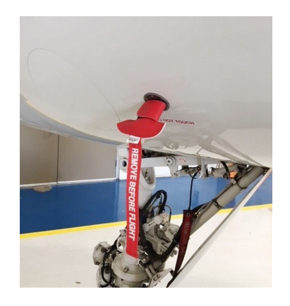
300 gal. CENTERLINE FUEL TANK PYLON COVER, with/without forms pouch Grumman Gulfstream G-V Rosemont/TAT Cover