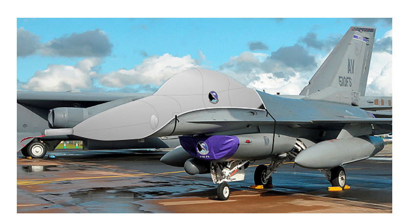
F-16 Canopy/Nose Cover