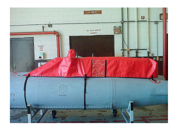
370 gal. WING FUEL TANK PYLON COVER, with/without forms pouch

WINTER USE MATERIAL - Made with Solution-Dyed Polyester fabric, this option is intended for seasonal use to aid in deicing, rain mitigation, or for occasional travel. The material is lighter and more compact, but more susceptible to UV damage and may have a shorter useful life if used continuously outside than the all-year use material.