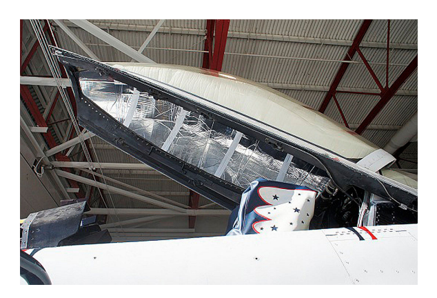
F-16 Cockpit HeatShields and Maintenance Seat Cover