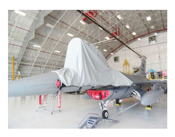
F-16 CANOPY COVER, OPEN POSITION (C-Model, single seat models)