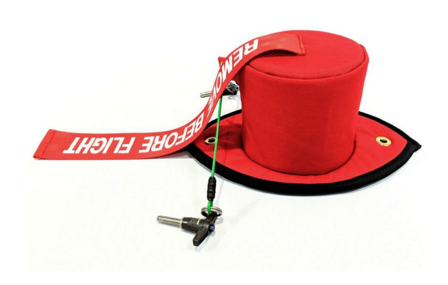
General Dynamics F-16 AOA Probe Cover