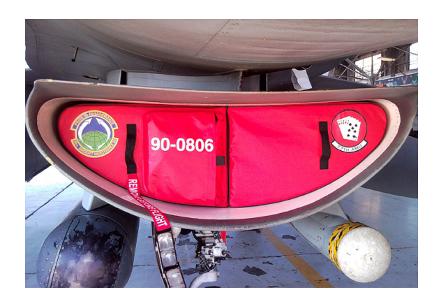
F-16 Folding Intake Plug with Forms Pouch and Custom Artwork

The Engine Inlet Plugs are custom fit for your General Dynamics F-16 Fighting Falcon intakes, made with heavy-duty vinyl material, and stuffed with a single block of sculpted urethane foam. Each plug has a zipper that allows the foam to be removed and dried if necessary. Engine plugs have 'remove before flight' streamers sewn onto the face of the plugs. Most plugs are imprinted with the aircraft registration number in black for an extra charge. Storage bag NOT included. Engine plugs may be inserted after flight when the engine is still warm. Engine Inlet Plugs are commonly referred to as Cowl Plugs, Intake Plugs, Cowl Blocks, Engine Blocks, and Engine Bungs.