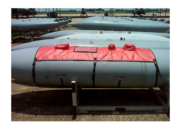
300 gal. CENTERLINE FUEL TANK PYLON COVER, with/without forms pouch