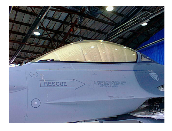
General Dynamics F-16 Cockpit HeatShields

Cockpit Heatshields are interior sunshades for the aircraft's cockpit. The product is a unique composite of closed-cell foam with a silver mylar finish. The semi-rigid design is stiff enough to stand inside the window framing. The set folds up flat and is easily stored in the included storage sleeve. Some designs may require velcro and suction cups. Our Heatshields for jets are offered white side out because some aircraft manufacturers have issued advisories against reflective window inserts due to potential heat damage. A Heatshield is an excellent short-term remedy for cockpit overheating, but an external fabric cover is more effective for long-term protection.