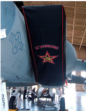
F15 Intake Cover

The McDonnell Douglas F-15 Eagle Intake Covers are designed to install easily yet be completely storable. A spring steel hoop is sewn into the hem of each cover, allowing them to be installed without climbing onto the wing or using a stepladder. To store the covers the spring steel hoop folds like a band-saw blade into three nesting rings. Each cover folds into a compact circular bundle which is stored in the included duffel bag, yet they unfold quickly for use. The Tri-Fold Ring cover is made of medium weight nylon which is available in a variety of colors to match the paint trim. Each cover set comes complete with installation and folding instructions. The aircraft's registration number can be silkscreened onto the cover for an extra charge.