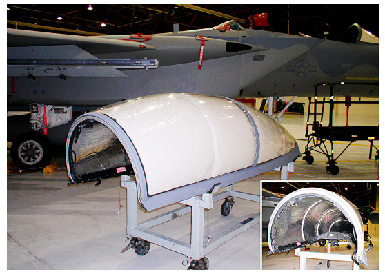
F-15 Cockpit HeatShield