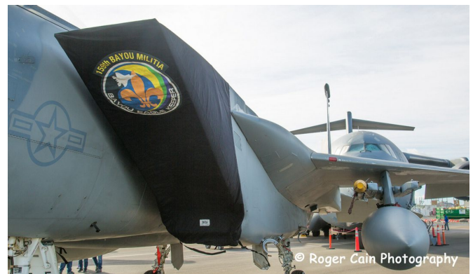
McDonnell-Douglas F-15 Intake Covers