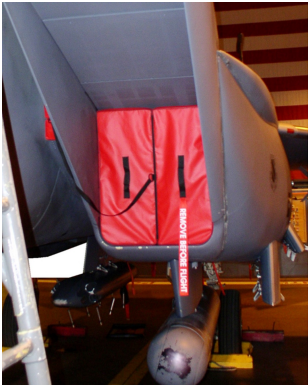
F15 Intake Plugs