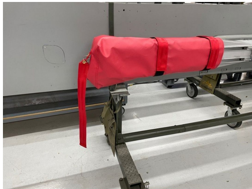
McDonnell Douglas F-15 Launcher Rail Cover

ALL-YEAR USE MATERIAL - Made with Silver Acrylic Sunbrella canvas, the all-year use material is the best option for sun protection and cover longevity. This heavier more durable material is intended for all weather conditions, such as rain and snow or lots of sun.