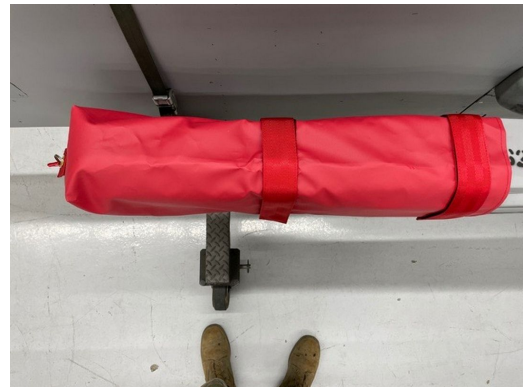
McDonnell Douglas F-15 Launcher Rail Cover