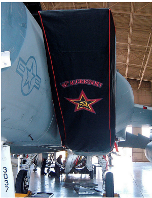
F15 Intake Cover