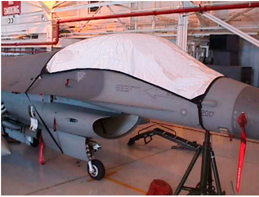
F-16 "Blackout" type Canopy Cover

Canopy Covers are commonly referred to as Cabin Covers, Fuselage Covers, Canvas Covers, Canopy Caps, etc.