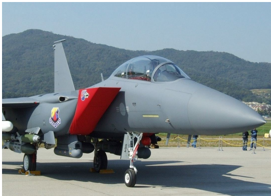
McDonnell Douglas F-15 Eagle Engine Inlet Covers

The McDonnell Douglas F-15 Eagle Intake Covers are designed to install easily yet be completely storable. A spring steel hoop is sewn into the hem of each cover, allowing them to be installed without climbing onto the wing or using a stepladder. To store the covers the spring steel hoop folds like a band-saw blade into three nesting rings. Each cover folds into a compact circular bundle which is stored in the included duffle bag, yet they unfold quickly for use. The Tri-Fold Ring cover is made of medium weight nylon which is available in a variety of colors to match the paint trim. Each cover set comes complete with installation and folding instructions. The aircraft's registration number can be silkscreened onto the cover for an extra charge.