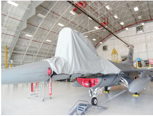
F-16 CANOPY COVER, OPEN POSITION (C-Model, single seat models)

Canopy Covers are commonly referred to as Cabin Covers, Fuselage Covers, Canvas Covers, Canopy Caps, etc.