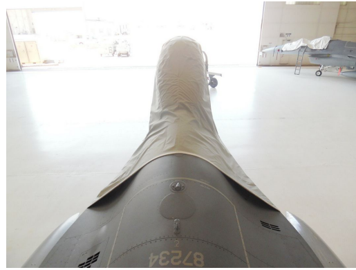
F-16 CANOPY COVER, OPEN POSITION (C-Model, single seat models)