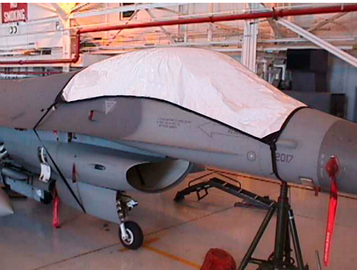
F-16 "Blackout" type Canopy Cover