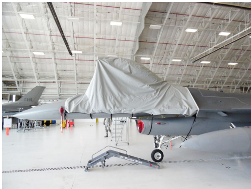
F-16 CANOPY COVER, OPEN POSITION (C-Model, single seat models)

Canopy Covers are commonly referred to as Cabin Covers, Fuselage Covers, Canvas Covers, Canopy Caps, etc.