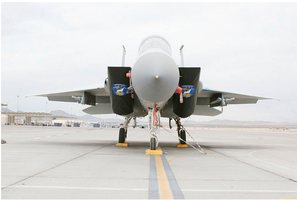
McDonnell-Douglas F-15 Intake Covers

The McDonnell Douglas F-15 Eagle Intake Covers are designed to install easily yet be completely storable. A spring steel hoop is sewn into the hem of each cover, allowing them to be installed without climbing onto the wing or using a stepladder. To store the covers the spring steel hoop folds like a band-saw blade into three nesting rings. Each cover folds into a compact circular bundle which is stored in the included duffle bag, yet they unfold quickly for use. The Tri-Fold Ring cover is made of medium weight nylon which is available in a variety of colors to match the paint trim. Each cover set comes complete with installation and folding instructions. The aircraft's registration number can be silkscreened onto the cover for an extra charge.