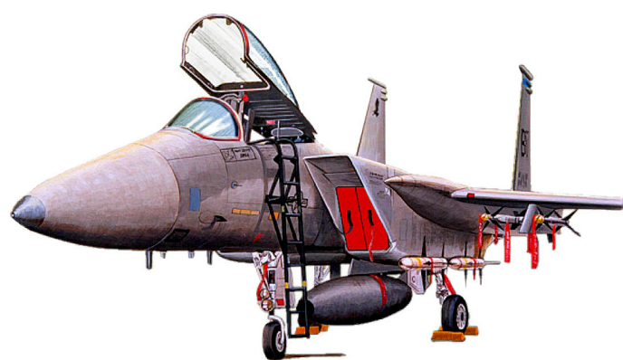
F15 Cockpit HeatShields & Intake Plugs

The Engine Inlet Plugs are custom fit for your McDonnell Douglas F-15 Eagle intakes, made with heavy-duty vinyl material, and stuffed with a single block of sculpted urethane foam. Each plug has a zipper that allows the foam to be removed and dried if necessary. Engine plugs have 'remove before flight' streamers sewn onto the face of the plugs. Most plugs are imprinted with the aircraft registration number in black for an extra charge. Storage bag NOT included. Engine plugs may be inserted after flight when the engine is still warm. Engine Inlet Plugs are commonly referred to as Cowl Plugs, Intake Plugs, Cowl Blocks, Engine Blocks, and Engine Bungs.