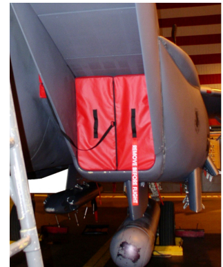
F15 Intake Plugs