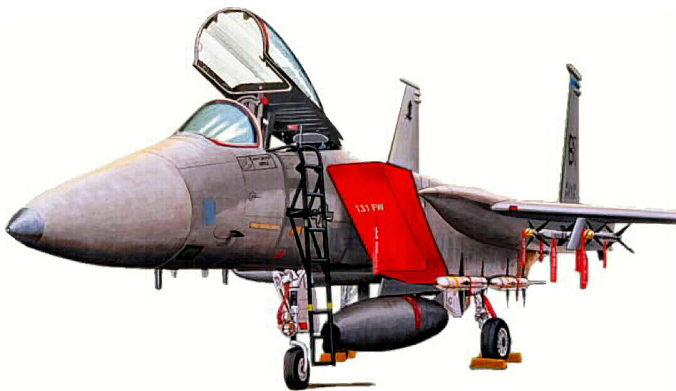
F15 Cockpit HeatShields & Inlet Cover

The McDonnell Douglas F-15 Eagle Intake Covers are designed to install easily yet be completely storable. A spring steel hoop is sewn into the hem of each cover, allowing them to be installed without climbing onto the wing or using a stepladder. To store the covers the spring steel hoop folds like a band-saw blade into three nesting rings. Each cover folds into a compact circular bundle which is stored in the included duffle bag, yet they unfold quickly for use. The Tri-Fold Ring cover is made of medium weight nylon which is available in a variety of colors to match the paint trim. Each cover set comes complete with installation and folding instructions. The aircraft's registration number can be silkscreened onto the cover for an extra charge.