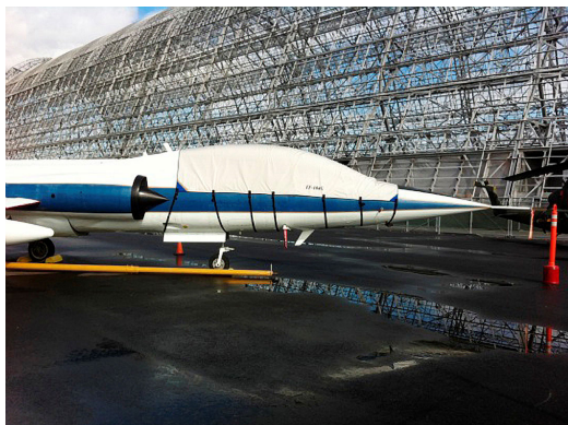
F-104 Tandem Canopy Cover

This cover type is made from Silver Acrylic Sunbrella canvas and is 100% lined with a soft and smooth microfiber. Bruce's Custom Covers developed this material combination especially for aircraft protection. The outer material is medium weight and treated for water resistance, UV resistance and anti-static buildup. The inner lining is a very soft and smooth microfiber to prevent scratching. The material is very reflective, and tests show that the cabin interior temperature can be reduced to near-ambient temperature on the hottest of days. It is water, ice and snow repellent, yet breathable to allow moisture to escape from between the cover and the aircraft surface.