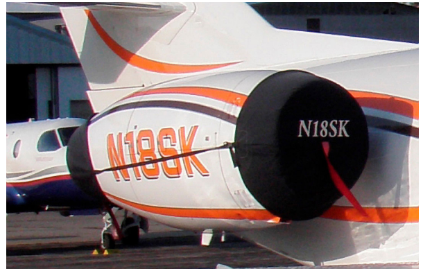
Falcon Jet Engine Intake/Exhaust Cover Set