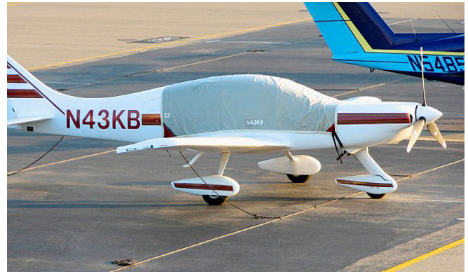
Wheeler Express Canopy Cover