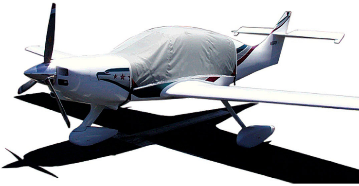
Wheeler Express Canopy Cover