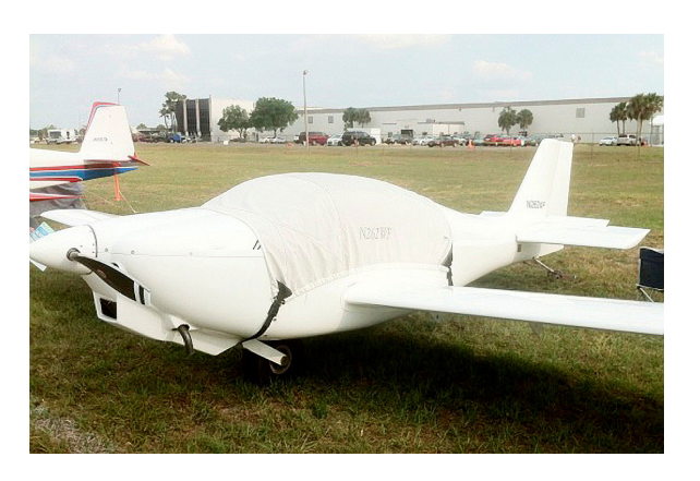
Europa XS Canopy Cover