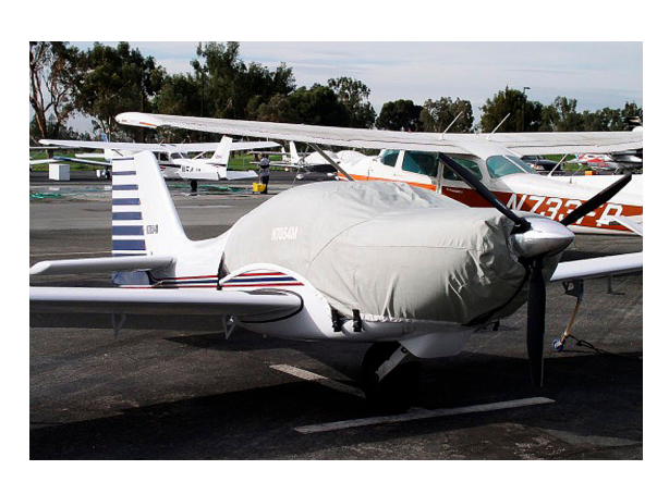
Europa Canopy/Engine Cover