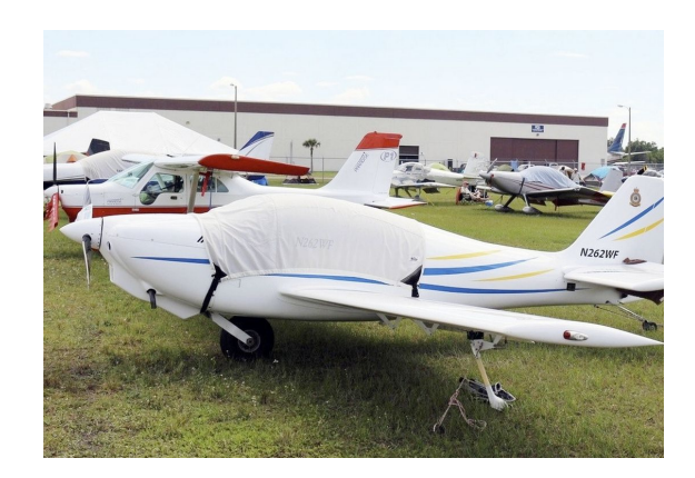
Europa Canopy Cover

The Europa All Europa Models Canopy/Engine Cover is a one-piece cover (100% lined with microfiber) that is a combination of the Canopy Cover and Engine Cover. This cover will enclose the engine cowl and will extend aft to cover all of the windows. This cover type is made from Silver Acrylic Sunbrella canvas and is 100% lined with a soft and smooth microfiber. Bruce's Custom Covers developed this material combination especially for aircraft protection. The outer material is medium weight and treated for water resistance, UV resistance and anti-static buildup. The inner lining is a very soft and smooth microfiber to prevent scratching. The material is very reflective, and tests show that the cabin interior temperature can be reduced to near-ambient temperature on the hottest of days. It is water, ice and snow repellent, yet breathable to allow moisture to escape from between the cover and the aircraft surface.