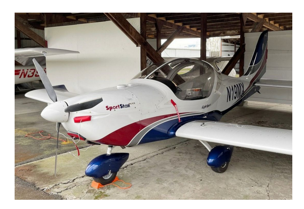
Evektor SportStar Engine & Vent Plugs

Engine Inlet Plugs are custom fit for your Evektor-Aerotechnik SportStar, Eurostar, Max, Harmony intakes, made with heavy-duty vinyl material, and stuffed with a single block of sculpted urethane foam. Each plug has a zipper that allows the foam to be removed and dried if necessary. Engine plugs have warning flags that are visible from the cockpit or 'remove before flight' streamers sewn onto the face of the plugs. Most plugs are imprinted with the aircraft registration number in black for an extra charge. Storage bag NOT included. Engine plugs may be inserted after flight when the engine is still warm. Engine Inlet Plugs are commonly referred to as Cowl Plugs, Intake Plugs, Cowl Blocks, Engine Blocks, and Engine Bungs.