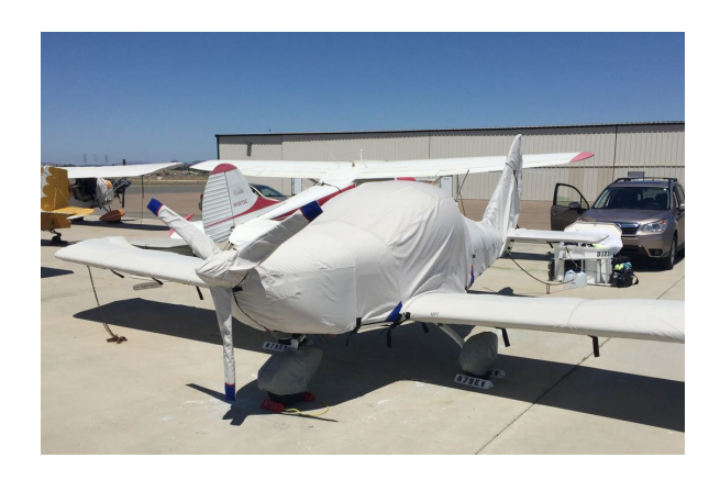
2017 Evector Sportstar Max All Year Use Wing Covers