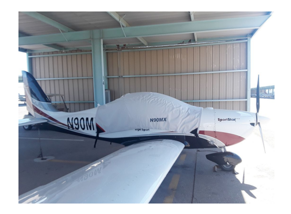
Evektor Sportstar Max Canopy Cover