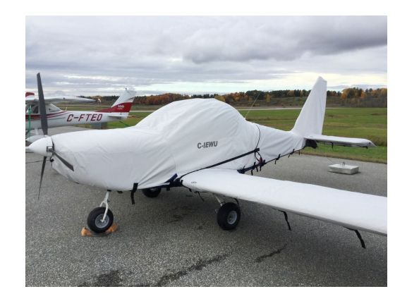
Evektor Sportstar Full Cover Set

This cover type is made from Silver Acrylic Sunbrella canvas and is 100% lined with a soft and smooth microfiber. Bruce's Custom Covers developed this material combination especially for aircraft protection. The outer material is medium weight and treated for water resistance, UV resistance and anti-static buildup. The inner lining is a very soft and smooth microfiber to prevent scratching. The material is very reflective, and tests show that the cabin interior temperature can be reduced to near-ambient temperature on the hottest of days. It is water, ice and snow repellent, yet breathable to allow moisture to escape from between the cover and the aircraft surface.