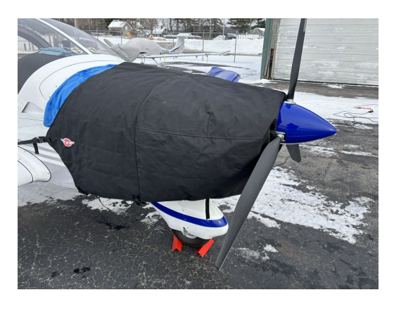
Evektor Harmony Insulated Engine Cover