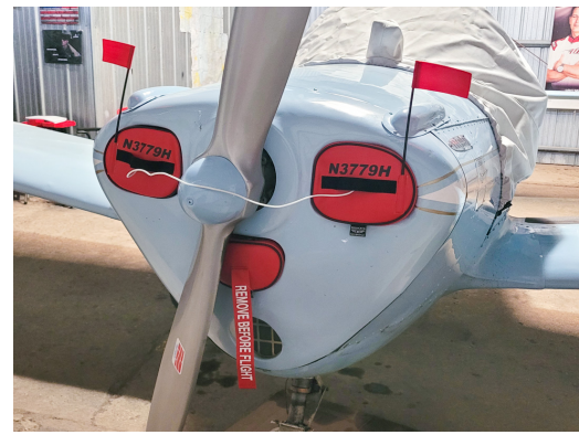
Ercoupe Engine Inlet Plugs