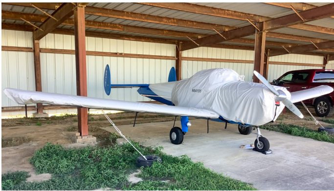
Ercoupe 415-C Wing Covers, All Year Use(set of 2)

WINTER USE MATERIAL - Made with Solution-Dyed Polyester fabric, this option is intended for seasonal use to aid in deicing, rain mitigation, or for occasional travel. The material is lighter and more compact, but more susceptible to UV damage and may have a shorter useful life if used continuously outside than the all-year use material.