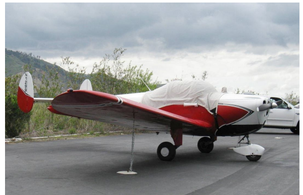
Ercoupe Canopy Cover