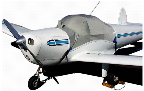
Ercoupe Canopy Cover, bubble windshield model