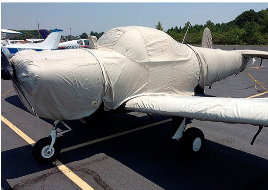
Ercoupe full cover set: Extended Canopy, Engine, Wing & Empennage covers

This cover type is made from Silver Acrylic Sunbrella canvas and is 100% lined with a soft and smooth microfiber. Bruce's Custom Covers developed this material combination especially for aircraft protection. The outer material is medium weight and treated for water resistance, UV resistance and anti-static buildup. The inner lining is a very soft and smooth microfiber to prevent scratching. The material is very reflective, and tests show that the cabin interior temperature can be reduced to near-ambient temperature on the hottest of days. It is water, ice and snow repellent, yet breathable to allow moisture to escape from between the cover and the aircraft surface.