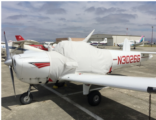
Ercoupe Extended Canopy Cover

This cover type is made from Silver Acrylic Sunbrella canvas and is 100% lined with a soft and smooth microfiber. Bruce's Custom Covers developed this material combination especially for aircraft protection. The outer material is medium weight and treated for water resistance, UV resistance and anti-static buildup. The inner lining is a very soft and smooth microfiber to prevent scratching. The material is very reflective, and tests show that the cabin interior temperature can be reduced to near-ambient temperature on the hottest of days. It is water, ice and snow repellent, yet breathable to allow moisture to escape from between the cover and the aircraft surface.