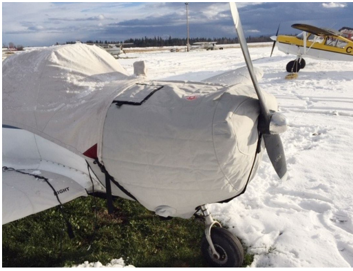
Ercoupe Insulated Engine Cover