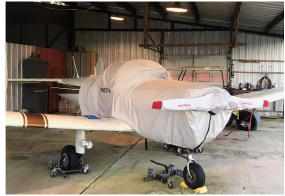
Ercoupe Extended Canopy/Engine & Prop Cover