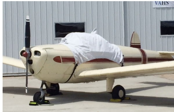
1946 Ercoupe 415-D Flat Windshield Canopy Cover