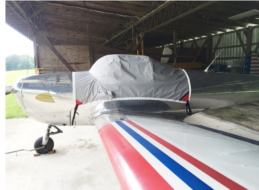
Ercoupe Light Weight Travel Cover