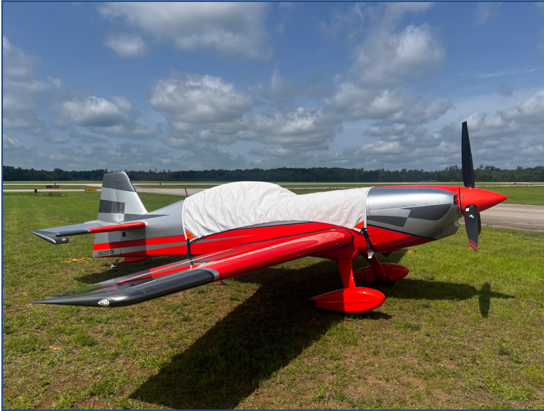
Extra NG Canopy Cover, Single Place Canopy