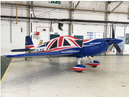
Extra 330 Canopy Cover, custom design

This cover type is made from Silver Acrylic Sunbrella canvas and is 100% lined with a soft and smooth microfiber. Bruce's Custom Covers developed this material combination especially for aircraft protection. The outer material is medium weight and treated for water resistance, UV resistance and anti-static buildup. The inner lining is a very soft and smooth microfiber to prevent scratching. The material is very reflective, and tests show that the cabin interior temperature can be reduced to near-ambient temperature on the hottest of days. It is water, ice and snow repellent, yet breathable to allow moisture to escape from between the cover and the aircraft surface.