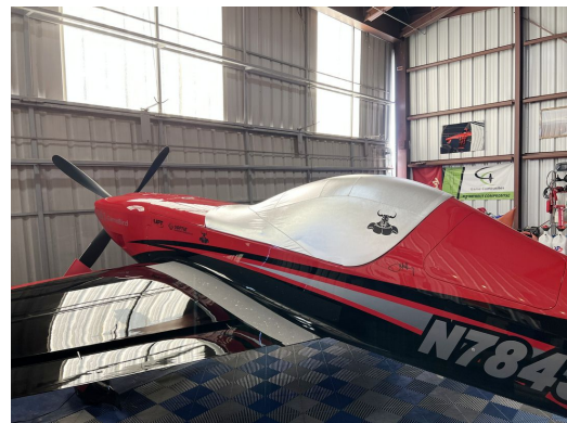
Gamebird GB-1 Solar Cap (single place), CUSTOM COVERS & IMPRINTING AVAILABLE!