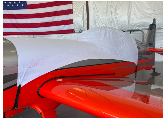
Extra NG Canopy Cover, Single Place Model, test fit cover