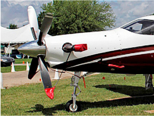
Epic Prop Tie-down/Exhaust cover set

This cover type is made from Silver Acrylic Sunbrella canvas and is 100% lined with a soft and smooth microfiber. Bruce's Custom Covers developed this material combination especially for aircraft protection. The outer material is medium weight and treated for water resistance, UV resistance and anti-static buildup. The inner lining is a very soft and smooth microfiber to prevent scratching. The material is very reflective, and tests show that the cabin interior temperature can be reduced to near-ambient temperature on the hottest of days. It is water, ice and snow repellent, yet breathable to allow moisture to escape from between the cover and the aircraft surface.