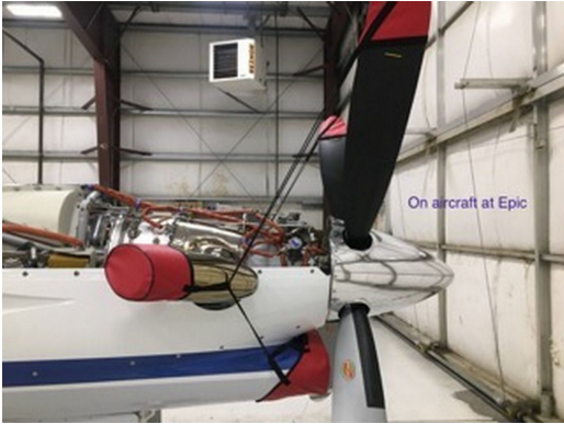
Epic Aircraft Prop Tie, Exhaust & Intake Covers