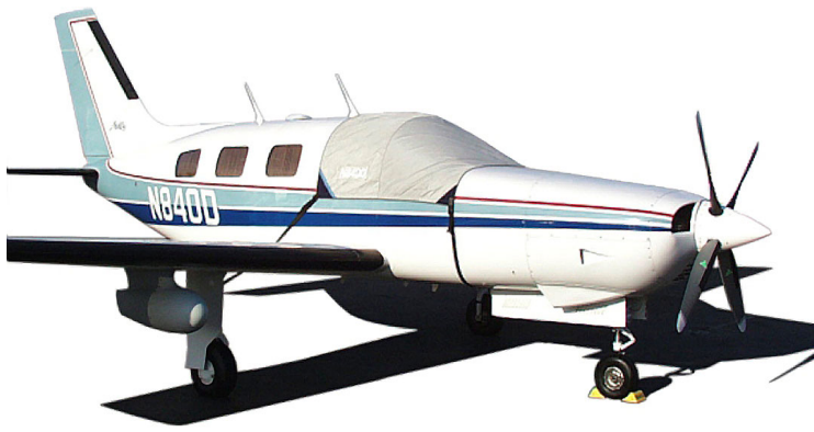
Piper Malibu/Mirage Windshield Cover