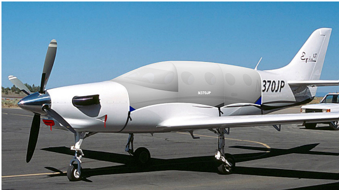
Epic LT Canopy Cover & Engine Plugs

Engine Inlet Plugs are custom fit for your Epic LT intakes, made with heavy-duty vinyl material, and stuffed with a single block of sculpted urethane foam. Each plug has a zipper that allows the foam to be removed and dried if necessary. Engine plugs have warning flags that are visible from the cockpit or 'remove before flight' streamers sewn onto the face of the plugs. Most plugs are imprinted with the aircraft registration number in black for an extra charge. Storage bag NOT included. Engine plugs may be inserted after flight when the engine is still warm. Engine Inlet Plugs are commonly referred to as Cowl Plugs, Intake Plugs, Cowl Blocks, Engine Blocks, and Engine Bungs.