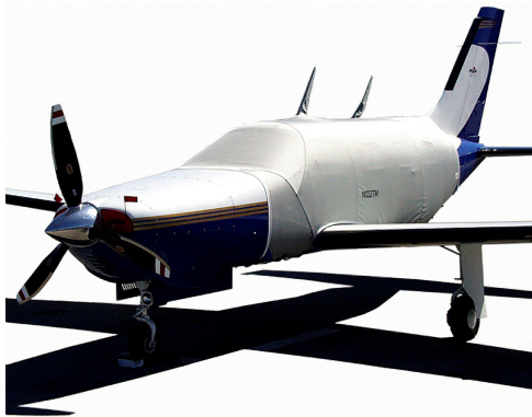
Piper Malibu/Mirage/Meridian Extended Canopy Cover