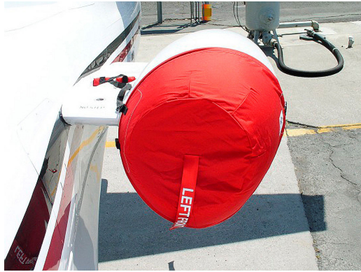
Eclipse Exhaust Cover & Pylon Wedge Plugs

The Eclipse EA500, TE500, 550 Bikini Style Engine Covers are a single-piece design using a soft and smooth stretchy fabric. The cover stretches tightly over both the intake and exhaust, installing quickly and easily. These covers are designed to be used as hangar dust covers and have a useful life of approximately one year.