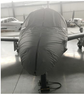
Eclipse EA550 Travel Canopy/Nose Cover

This cover type is made from Silver Acrylic Sunbrella canvas and is 100% lined with a soft and smooth microfiber. Bruce's Custom Covers developed this material combination especially for aircraft protection. The outer material is medium weight and treated for water resistance, UV resistance and anti-static buildup. The inner lining is a very soft and smooth microfiber to prevent scratching. The material is very reflective, and tests show that the cabin interior temperature can be reduced to near-ambient temperature on the hottest of days. It is water, ice and snow repellent, yet breathable to allow moisture to escape from between the cover and the aircraft surface.