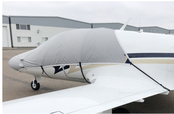
Customized to end before main antenna, with easy to use flat-hook straps.