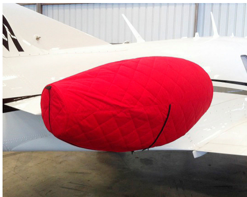
Eclipse Insulated Engine Cover

The Eclipse EA500, TE500, 550 Bikini Style Engine Covers are a single-piece design using a soft and smooth stretchy and fabric. The cover stretches tightly over both the intake and exhaust, installing quickly and easily. These covers are designed to be used as hangar dust covers and have a useful life of approximately one year.