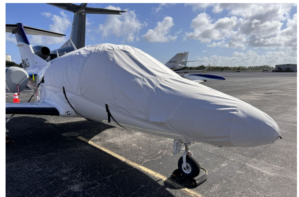
Eclipse EA500 Canopy/Nose Cover