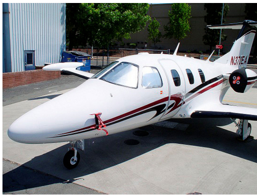
Eclipse Pitot Cover & Bikini Type Engine Covers