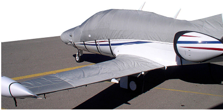
Fuselage Cover & Wing Covers with hail protection on all upper surfaces

This cover type is made from Silver Acrylic Sunbrella canvas and is 100% lined with a soft and smooth microfiber. Bruce's Custom Covers developed this material combination especially for aircraft protection. The outer material is medium weight and treated for water resistance, UV resistance and anti-static buildup. The inner lining is a very soft and smooth microfiber to prevent scratching. The material is very reflective, and tests show that the cabin interior temperature can be reduced to near-ambient temperature on the hottest of days. It is water, ice and snow repellent, yet breathable to allow moisture to escape from between the cover and the aircraft surface.