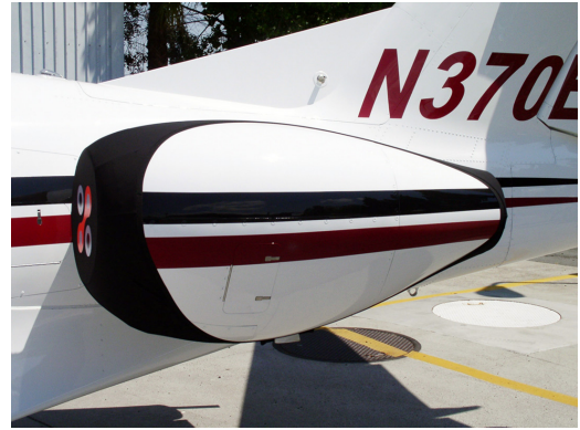
Bikini style Engine Covers