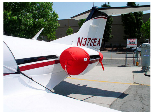
Eclipse Engine Covers