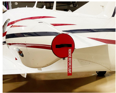
Eclipse EA500 Intake/Exhaust Plugs