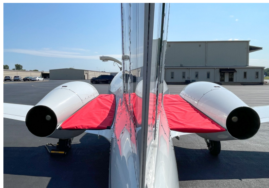
Eclipse EA500, TE500, 550 Pylon Covers