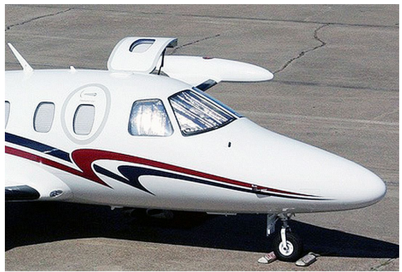
Eclipse Cockpit Heatshields