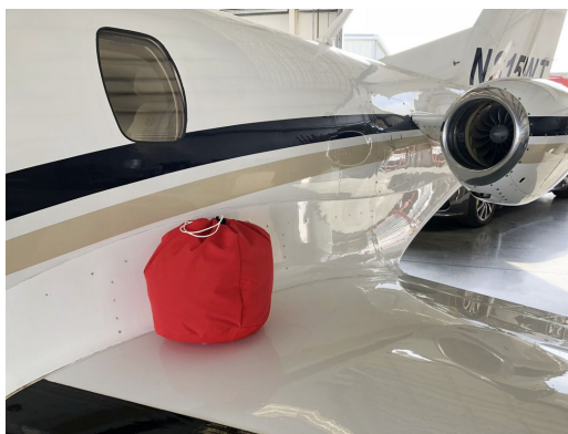
Eclipse EA500, TE500, 550 Travel Cover, Canopy/Nose Cover in Storage bag

This cover type is made from Silver Acrylic Sunbrella canvas and is 100% lined with a soft and smooth microfiber. Bruce's Custom Covers developed this material combination especially for aircraft protection. The outer material is medium weight and treated for water resistance, UV resistance and anti-static buildup. The inner lining is a very soft and smooth microfiber to prevent scratching. The material is very reflective, and tests show that the cabin interior temperature can be reduced to near-ambient temperature on the hottest of days. It is water, ice and snow repellent, yet breathable to allow moisture to escape from between the cover and the aircraft surface.