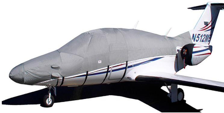
Fuselage Cover, hail protection on all upper surfaces

This cover type is made from Silver Acrylic Sunbrella canvas and is 100% lined with a soft and smooth microfiber. Bruce's Custom Covers developed this material combination especially for aircraft protection. The outer material is medium weight and treated for water resistance, UV resistance and anti-static buildup. The inner lining is a very soft and smooth microfiber to prevent scratching. The material is very reflective, and tests show that the cabin interior temperature can be reduced to near-ambient temperature on the hottest of days. It is water, ice and snow repellent, yet breathable to allow moisture to escape from between the cover and the aircraft surface.