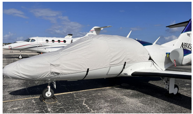
Eclipse EA500 Canopy/Nose Cover