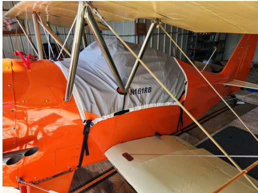
Burt Special Canopy Cover

This cover type is made from Silver Acrylic Sunbrella canvas and is 100% lined with a soft and smooth microfiber. Bruce's Custom Covers developed this material combination especially for aircraft protection. The outer material is medium weight and treated for water resistance, UV resistance and anti-static buildup. The inner lining is a very soft and smooth microfiber to prevent scratching. The material is very reflective, and tests show that the cabin interior temperature can be reduced to near-ambient temperature on the hottest of days. It is water, ice and snow repellent, yet breathable to allow moisture to escape from between the cover and the aircraft surface.