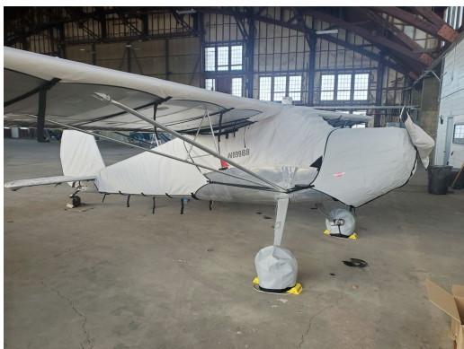
Cessna 140 Canopy, Wings, Prop, Tires & Empennage Covers

WINTER USE MATERIAL - Made with Solution-Dyed Polyester fabric, this option is intended for seasonal use to aid in deicing, rain mitigation, or for occasional travel. The material is lighter and more compact, but more susceptible to UV damage and may have a shorter useful life if used continuously outside than the all-year use material.