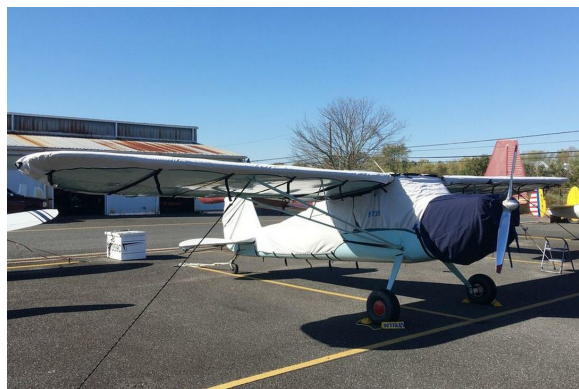
Cessna 140 Insulated Engine, Canopy, Empennage & Wing Covers

WINTER USE MATERIAL - Made with Solution-Dyed Polyester fabric, this option is intended for seasonal use to aid in deicing, rain mitigation, or for occasional travel. The material is lighter and more compact, but more susceptible to UV damage and may have a shorter useful life if used continuously outside than the all-year use material.