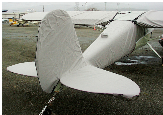
Cessna 120 Empennage Cover