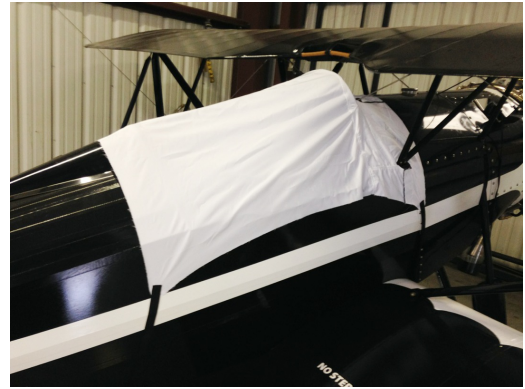
Rose Parrakeet Canopy Cover (test fit cover)