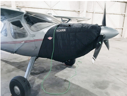
Glasair Aviation Glastar, Sportsman 2+2 Insulated Engine Cover Glasair Aviation Glastar, Sportsman 2+2 Insulated Engine Cover