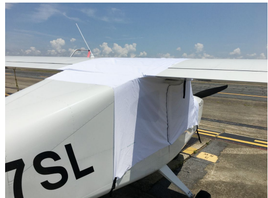
Vashon Ranger VR-7 Canopy Cover, test fit cover