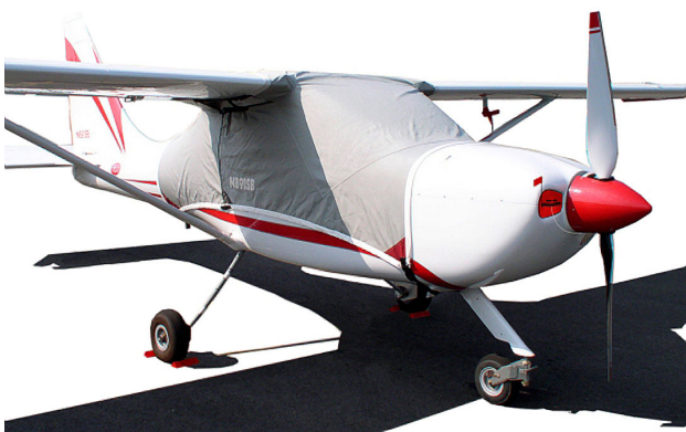
Glastar Over-Top Canopy Cover