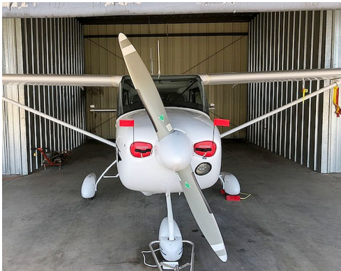
2006 OMF Symphony SA160

a single block of sculpted urethane foam. Each plug has a zipper that allows the foam to be removed and dried if necessary. Engine plugs have warning flags that are visible from the cockpit or 'remove before flight' streamers sewn onto the face of the plugs. Most plugs are imprinted with the aircraft registration number in black for an extra charge. Storage bag NOT included. Engine plugs may be inserted after flight when the engine is still warm. Engine Inlet Plugs are commonly referred to as Cowl Plugs, Intake Plugs, Cowl Blocks, Engine Blocks, and Engine Bungs.