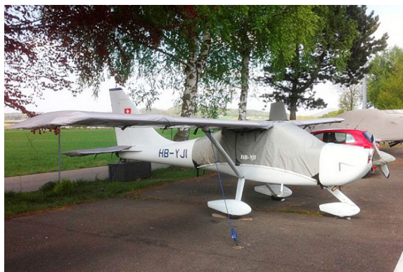
OMF Symphony Canopy, Wings, Horiz. Stab, and Prop Covers