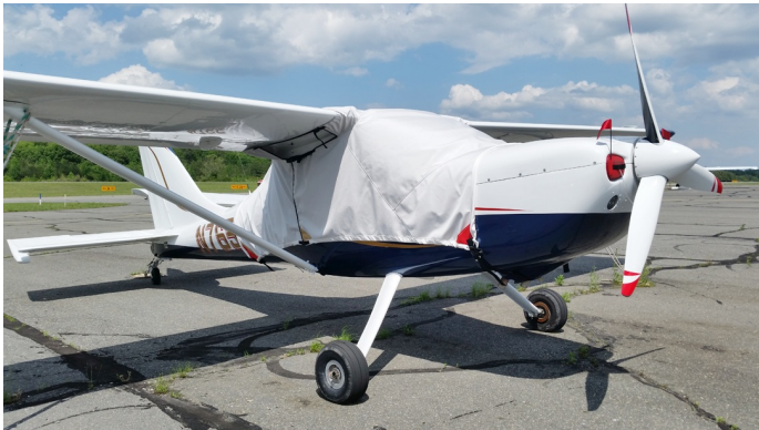
Glastar Over-Top Canopy Cover, Engine Plugs