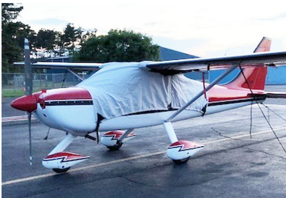
Glasair Aviation Glastar, Sportsman 2+2 Canopy Cover (Over-The-Top Style)

This cover type is made from Silver Acrylic Sunbrella canvas and is 100% lined with a soft and smooth microfiber. Bruce's Custom Covers developed this material combination especially for aircraft protection. The outer material is medium weight and treated for water resistance, UV resistance and anti-static buildup. The inner lining is a very soft and smooth microfiber to prevent scratching. The material is very reflective, and tests show that the cabin interior temperature can be reduced to near-ambient temperature on the hottest of days. It is water, ice and snow repellent, yet breathable to allow moisture to escape from between the cover and the aircraft surface.